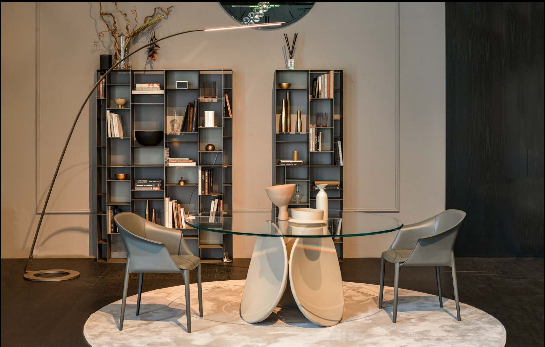
table MAXIM: extraclear top, Cairo base chairs ZULEIKA: soft leather 953 ardesia bookcases LATITUDE: titanium