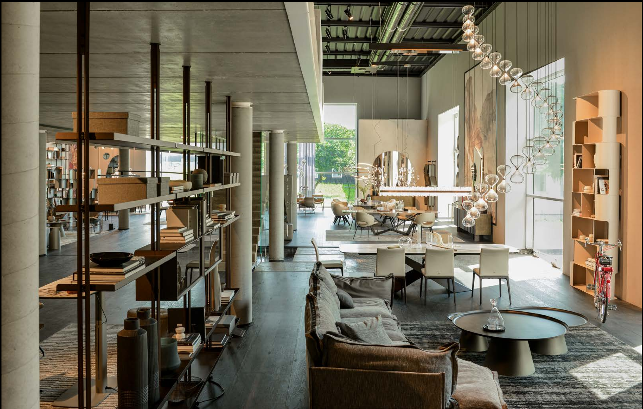
left bookcase FREEWAY: bronze right bookcases FULHAM: Pearl coffee tables AMERIGO: Brushed Grey