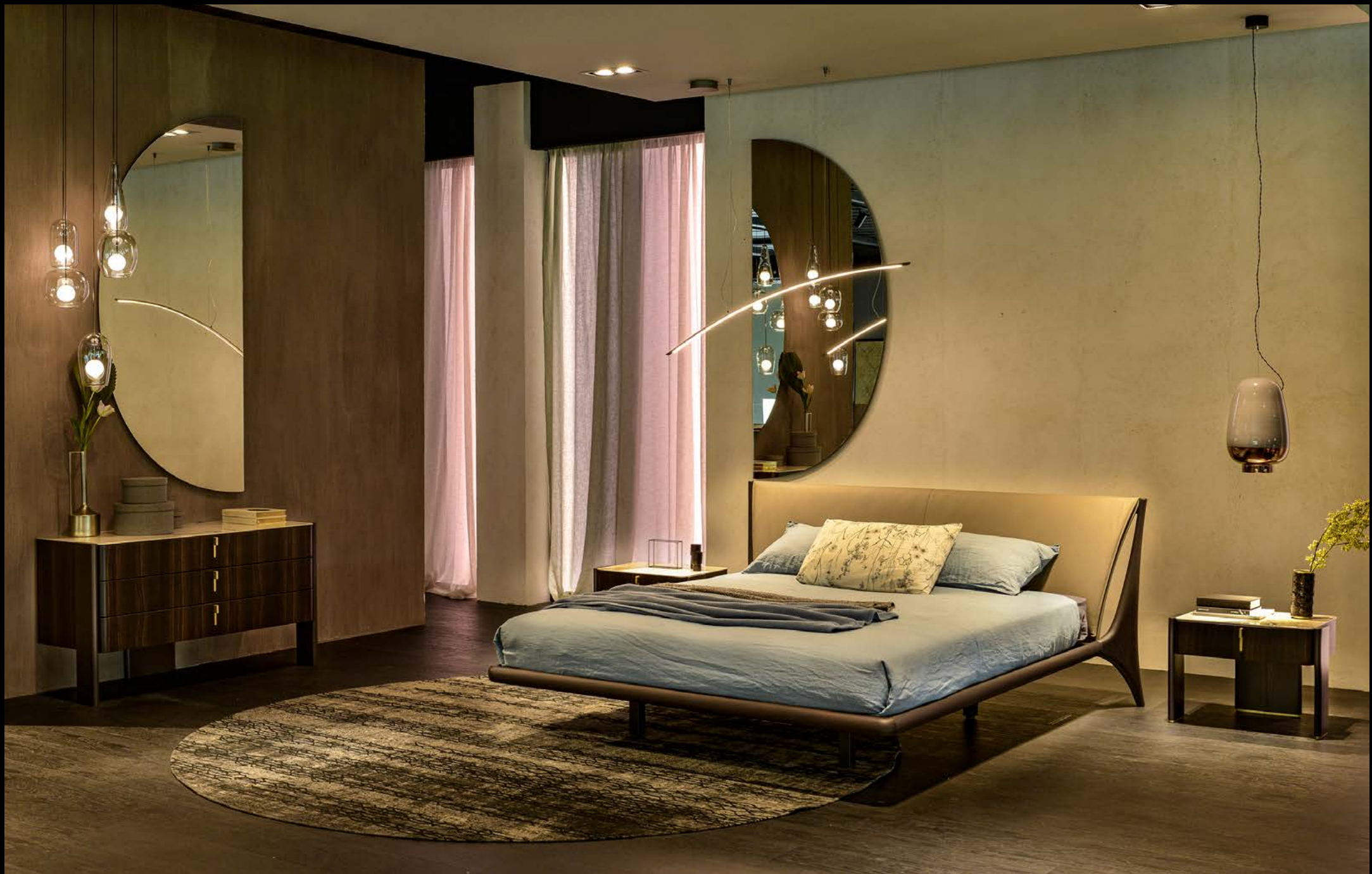
nightstands and dresser JULIAN : corcovado top, burned oak frame mirrors DAY lamps MELODY