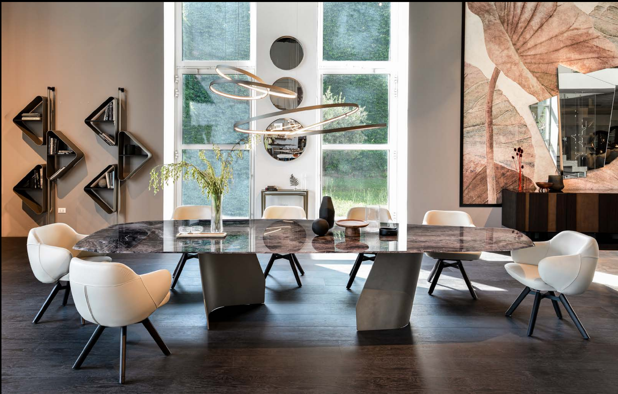
table SENATOR : orobico top, titanium base chairs BOMBÈ : soft leather 948 lino, burned oak frame ceiling lamps HEAVEN 1-2