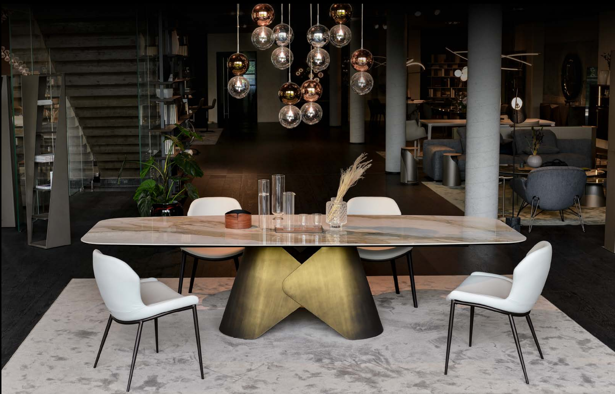
table SCOTT KEARAMIK : Corcovado top, Oxybrass base chairs RACHEL ML : soft leather 972 Canova , bronze frame chairs RACHEL WOOD : soft leather 972 Canova , burned oak frame

rug KIMI : 300x400 tortora lamps APOLLO : 8 oval bookcase ROCKET : titanium