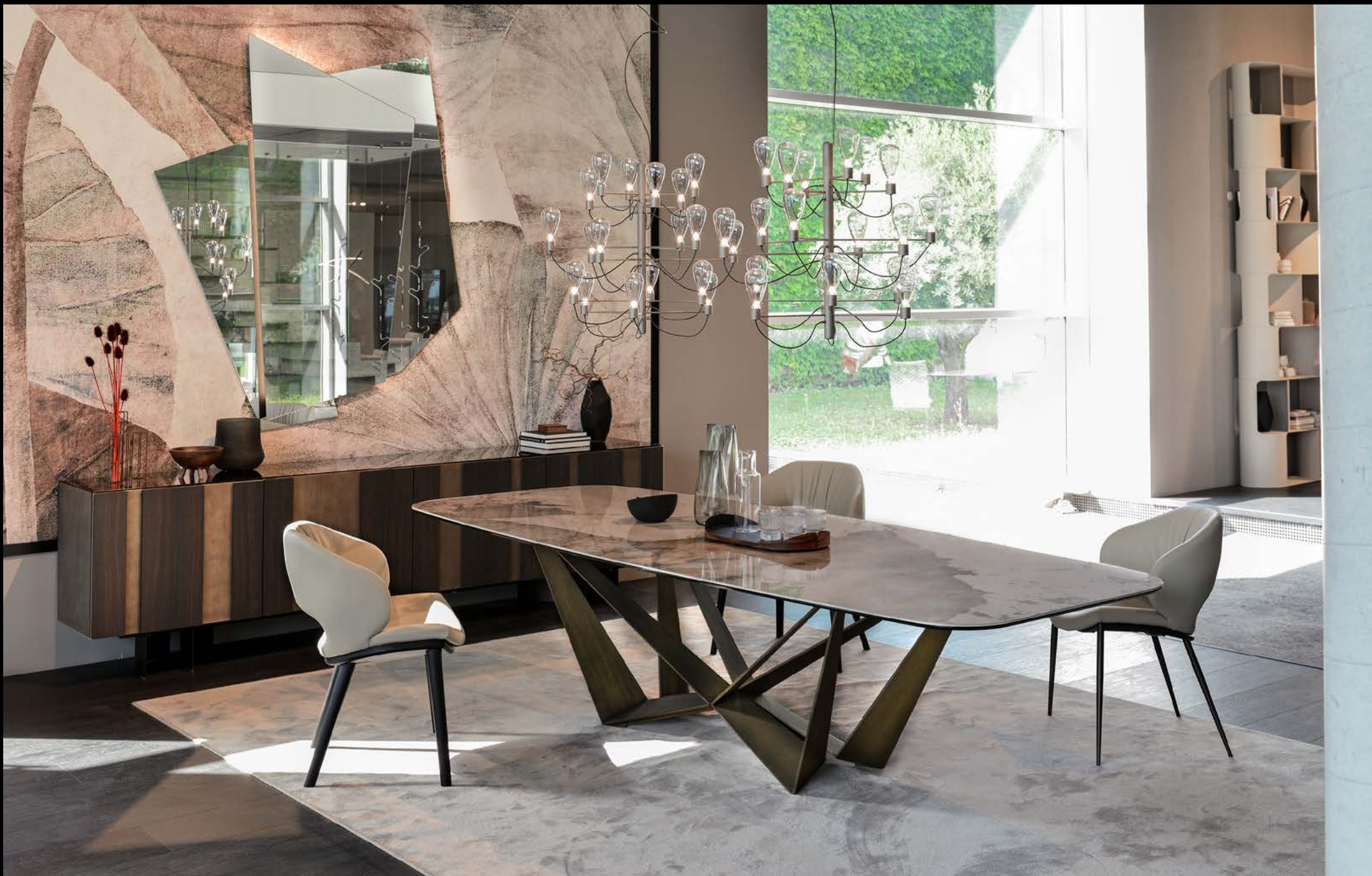
table SKORPIO KERAMIK : Corcovado top, Oxybrass base chairs MIRANDA WOOD : soft leather 969 Cashmere , burned oak frame chair MIRANDA ML : soft leather 969 Cashmere , bronze frame

sideboard AMSTERDAM : 4 doors rug KIMI : 300x400 tortora mirror RISIKO : 159x184