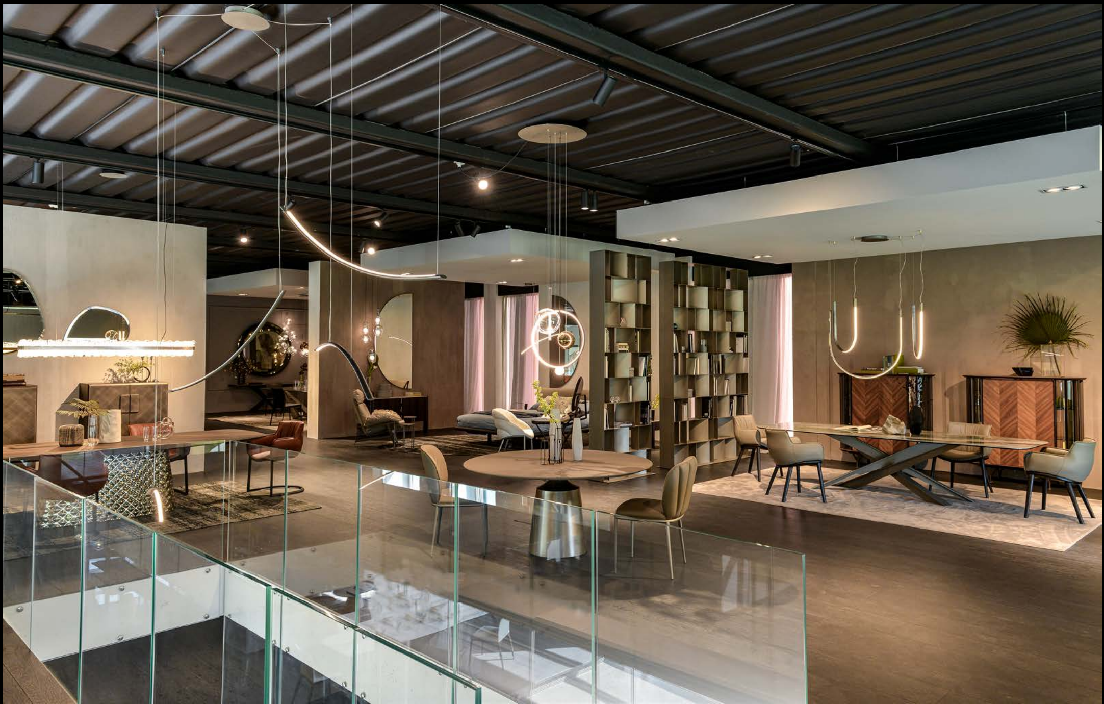
ceiling lamps KATANA