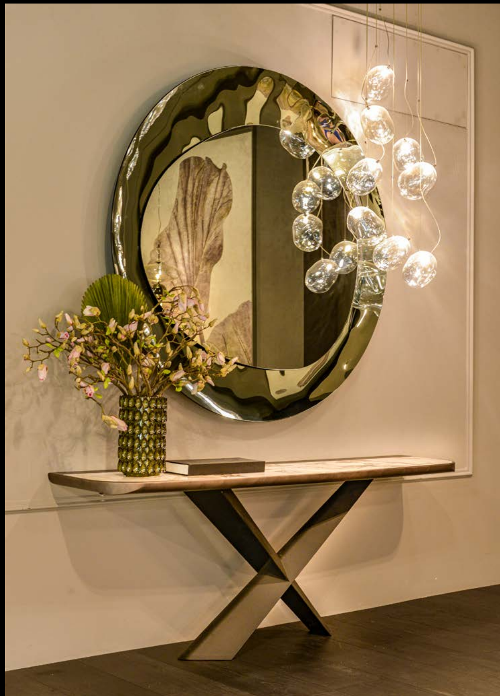
console TERMINAL KERAMIK PREMIUM makalu top, graphite base and Brushed Bronze profile mirror COSMOS: fumè ø157 lamps CLOUDINE