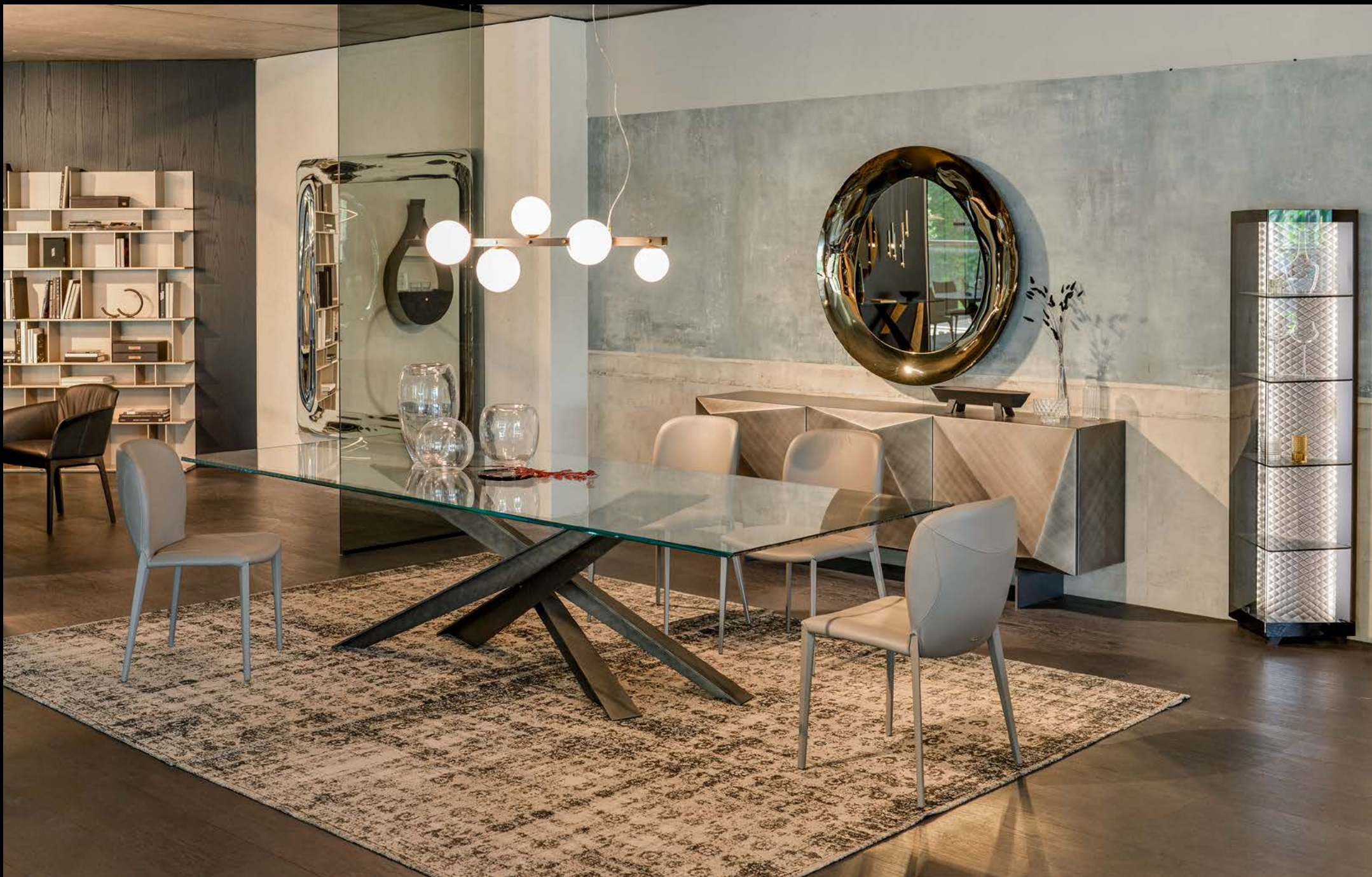
table LANCER: extraclear top, Brushed Grey base chairs NANCY ML : soft leather 983 argilla, titanium frame chairs NANCY : soft leather 983 argilla lamp PLANETA

rug MAPOON: 200x300 sideboard KAYAK: Brushed Grey mirror COSMOS: ø120 fumè showcase ATELIER: synthetic leather ECP48 lino