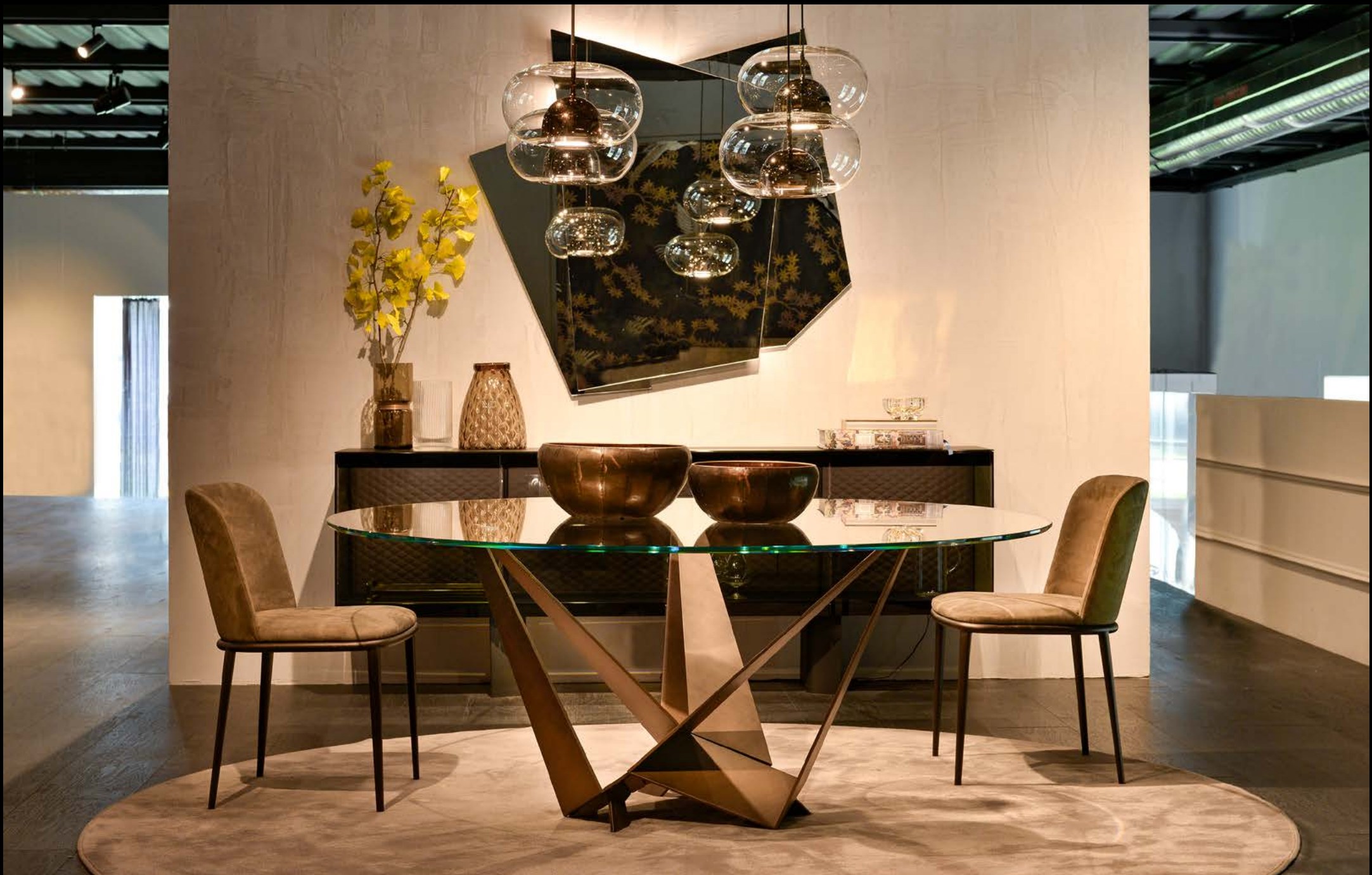
table SKORPIO ROUND: extraclear top, Brushed Bronze base chairs MAGDA ML: micronabuc MN603 cognac, bronze frame sideboard BOUTIQUE: synthetic leather ECP26 fango