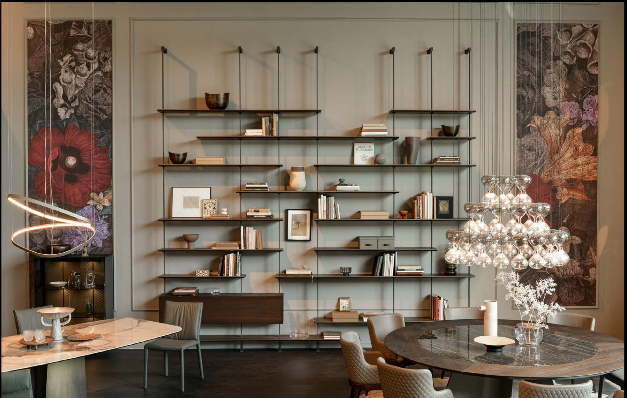
table ATRIUM KERAMIK LIFT : Corcovado top, Oxybrass base chairs ISABEL : soft leather 952 smoke lamps MAGELLANO 2