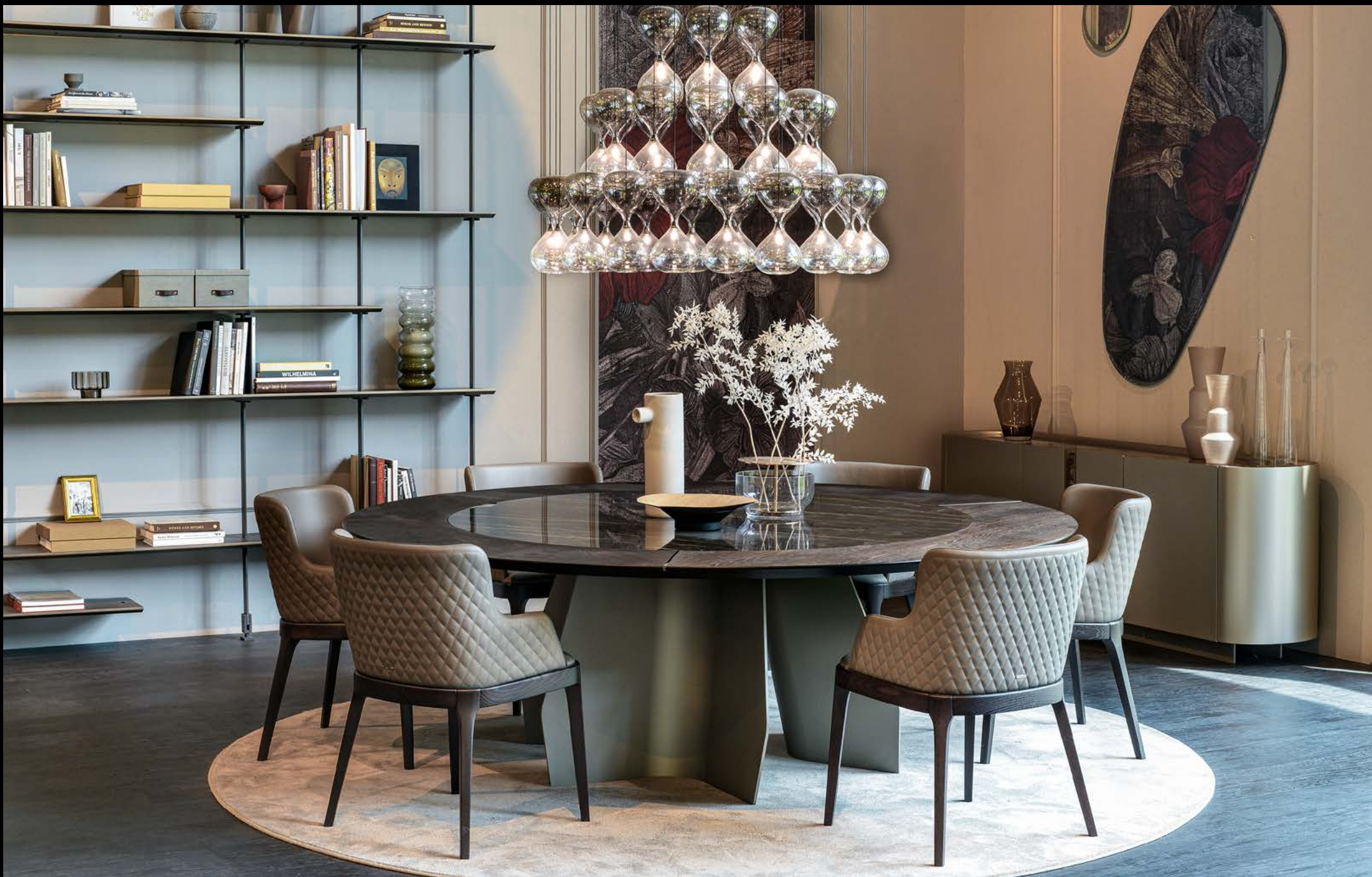
table SENATOR KER-WOOD ROUND: glossy portoro and burned oak top, titanium base chairs MAGDA COUTURE B: soft leather 951 castoro, burned oak frame

sideboard DYNASTY: titanium frame, orobico top bookcase AIRPORT: graphite structure, Brushed Bronze shelves rug KIMI: ø300 tortora