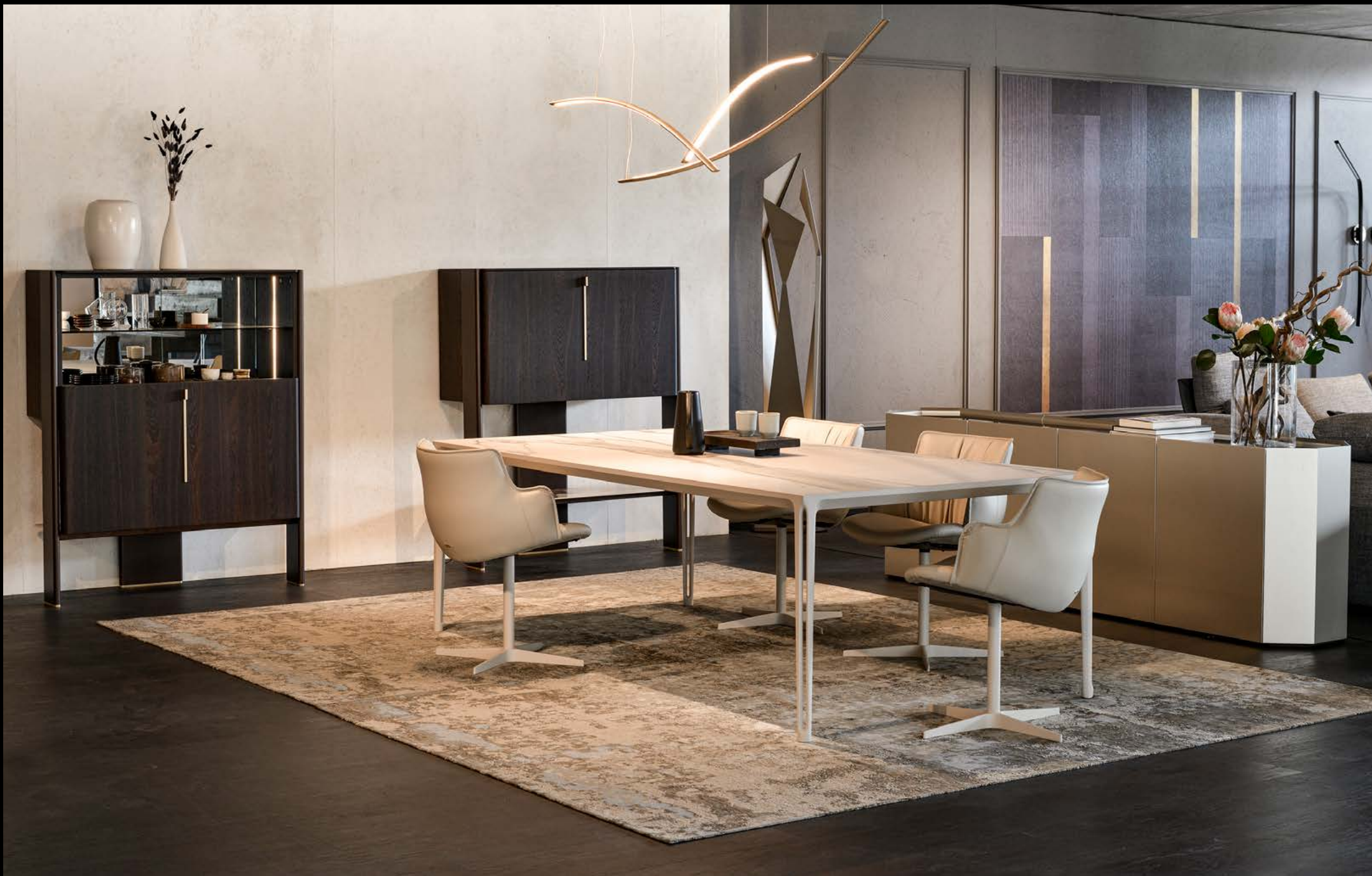
table BOULEVARD KERAMIK : matt golden calacatta top, Pearl base chairs RIHANNA X : soft leather 948 lino, Pearl frame sideboards CREMONA : burned oak door, corcovado shelf sideboard CHELSEA : titanium

rug RADJA : 200x300 ceiling lamps KATANA floor lamp THRILLER