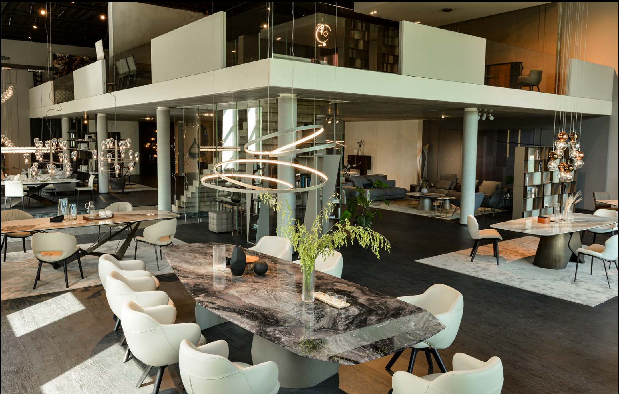
table SKORPIO KERAMIK: Corcovado top, Oxybrass base chairs MIRANDA ML and WOOD : soft leather 969 Cashmere rug KIMI: 300x400 tortora