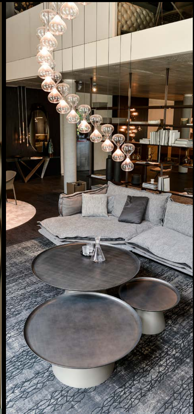
coffee tables AMERIGO: Brushed Grey side tables SPILLO: Brushed Grey rug MUMBAI: 300x400