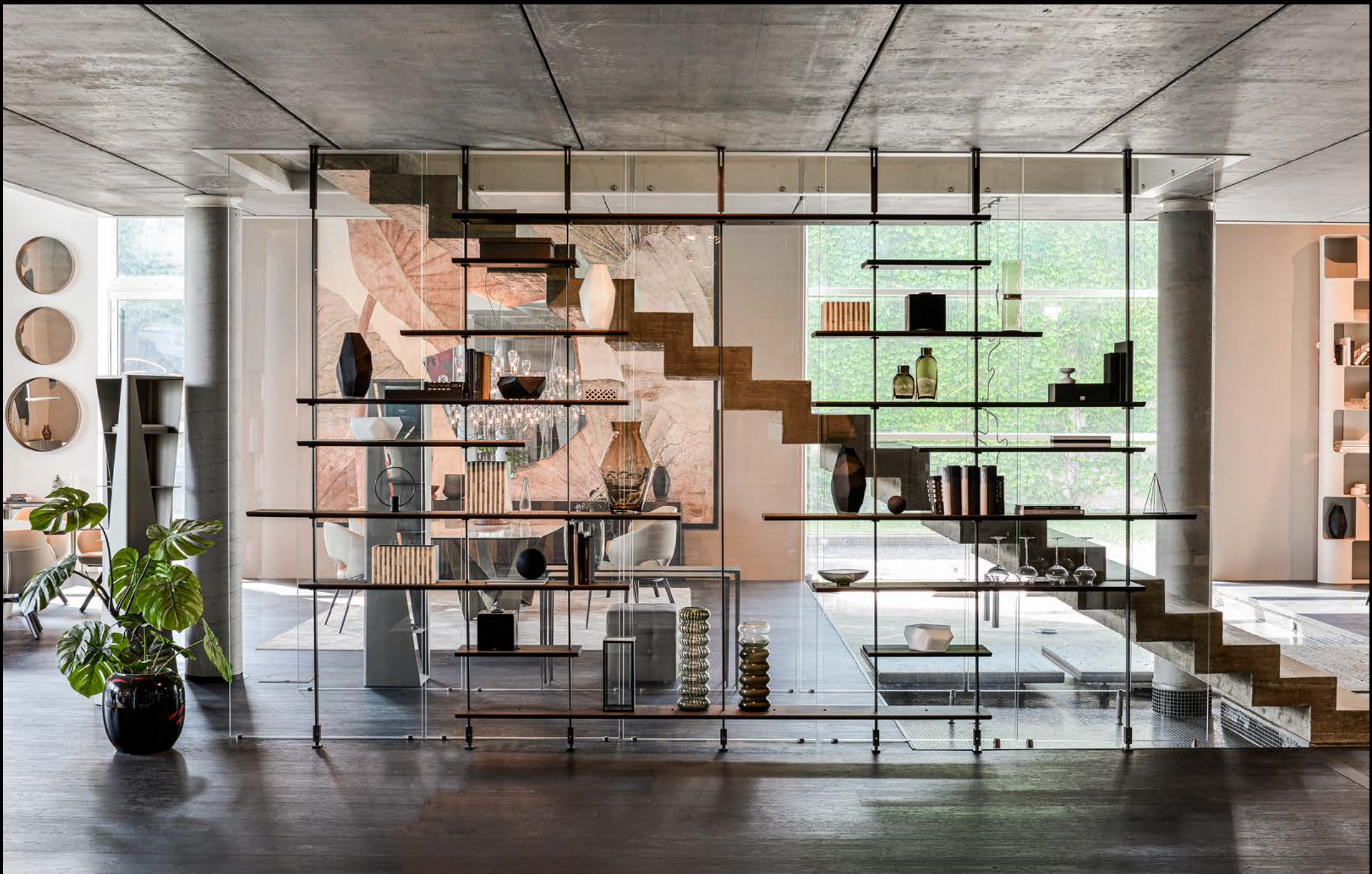
bookcase AIRPORT: graphite structure, burned oak shelves left bookcases ROCKET: titanium mirrors WISH: Brushed Bronze