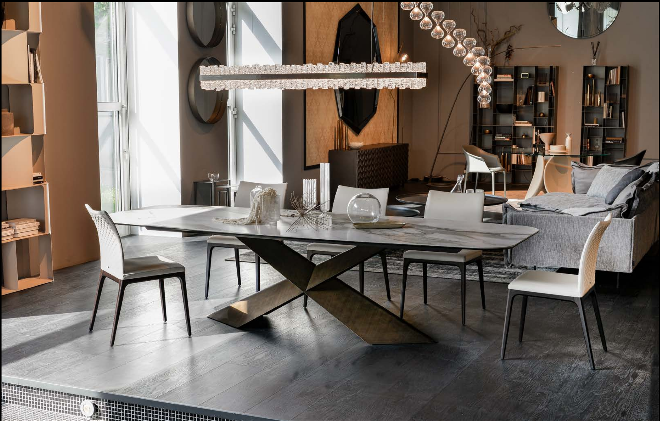
table TYRON KERAMIK: matt Borghini Calacatta top, Brushed Bronze base chairs ARCADIA COUTURE: soft leather 948 lino, burned oak frame lamp PHOENIX S2