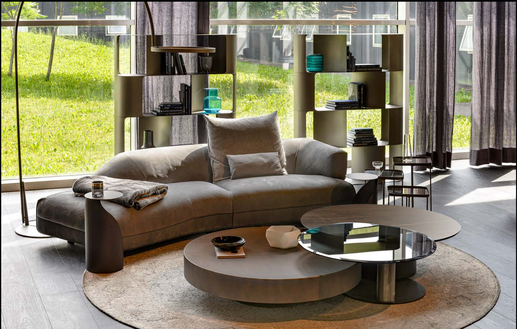
coffee table ARENA KERAMIK BOND : matt portoro top, BB column coffee table ARENA : Brushed Bronze side tables PENGUIN : bronze side tables BENNY : bronze mirrored top, BB frame, bronze base