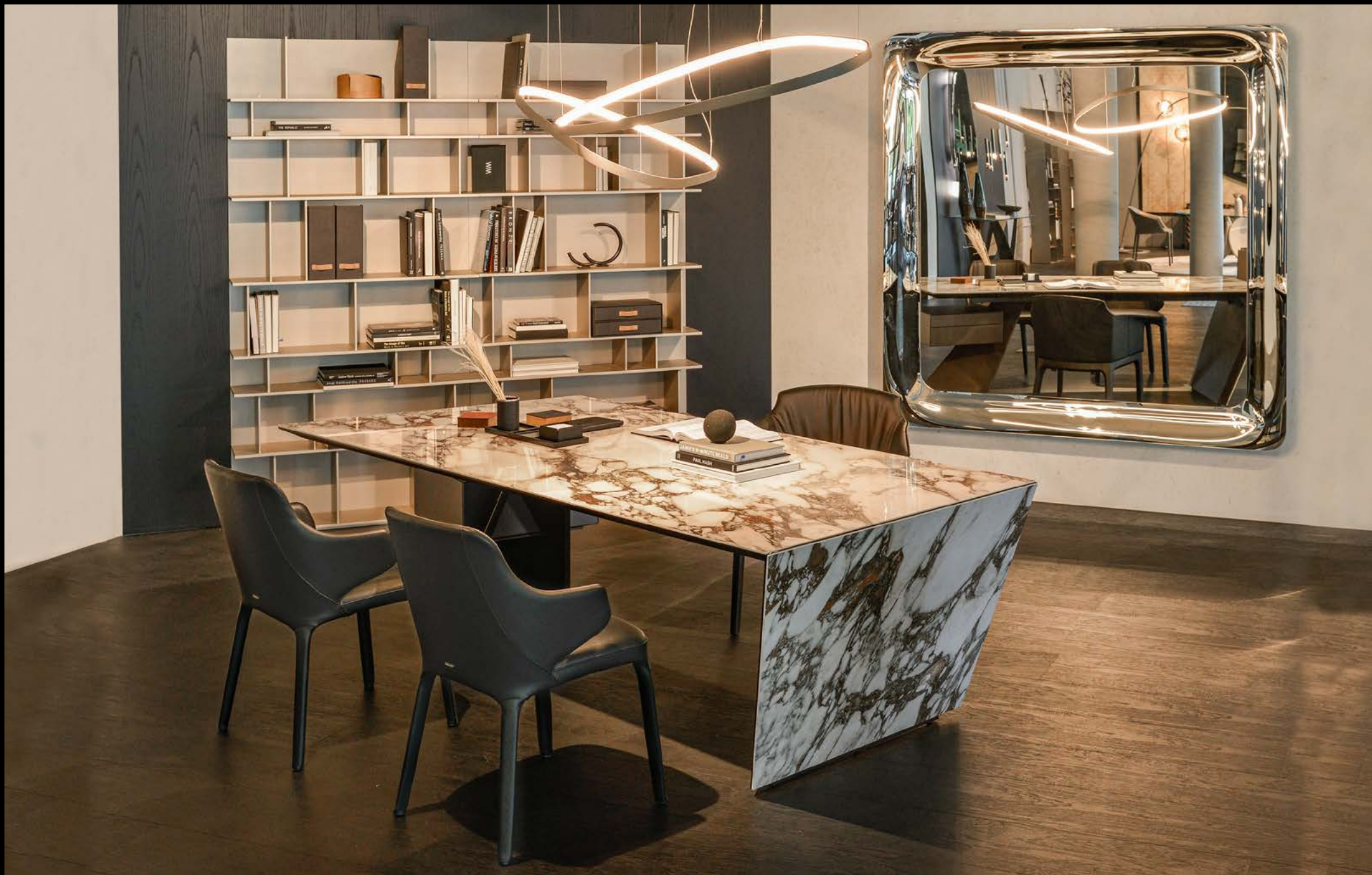
desk NASDAQ KERAMIK: Breccia top, bronze base chairs WANDA: soft leather 973 nero chair MUSA: soft leather 973 nero, burned oak frame