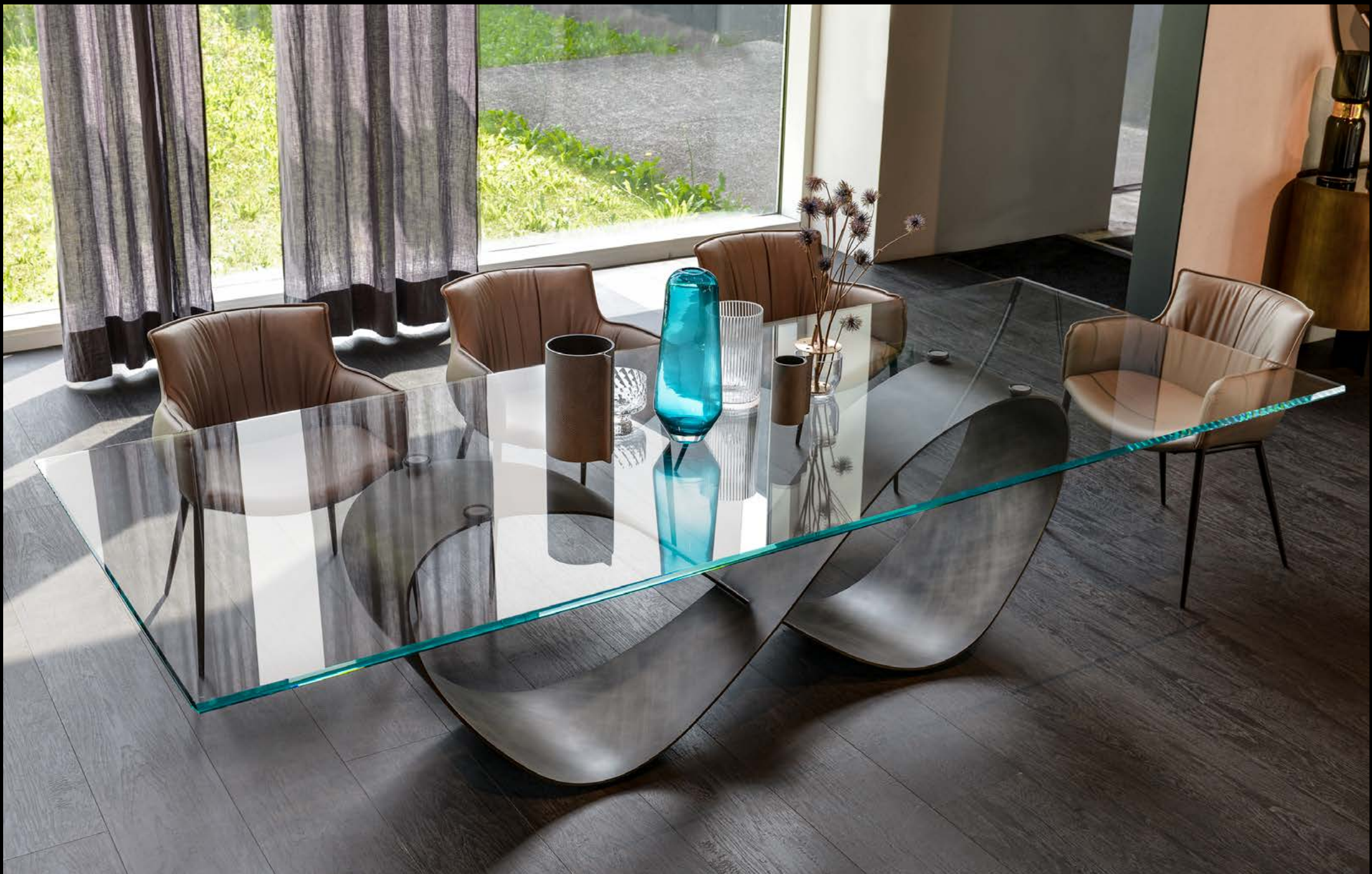
table BUTTERFLY: extraclear, bevelled top, Brushed Grey base chairs RHONDA: soft leather glove GLV07 argo, bronze frame