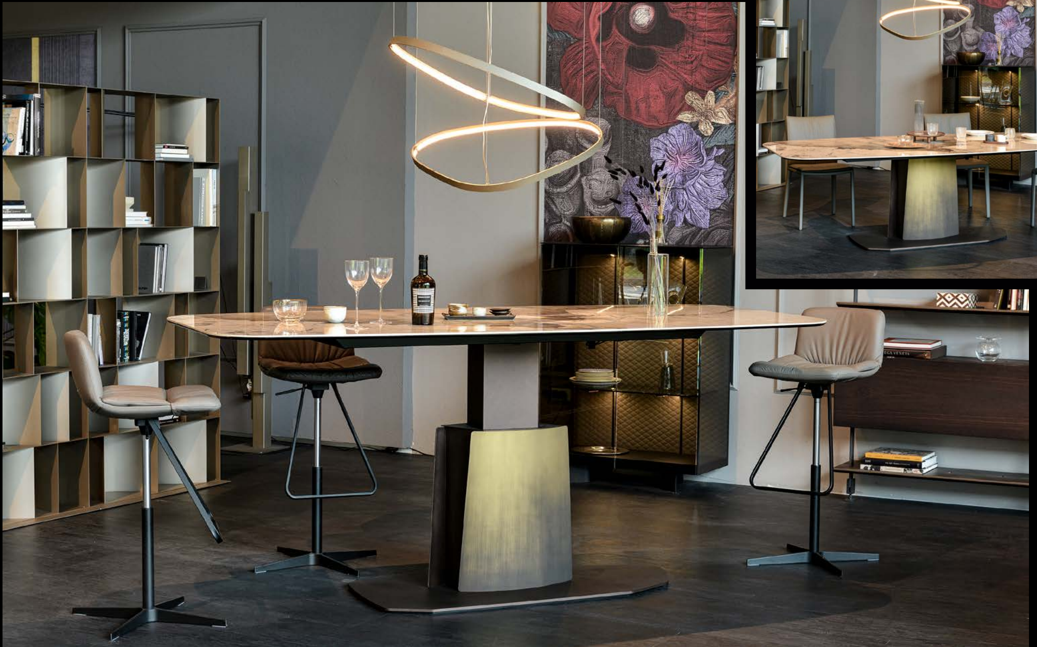
table ATRIUM KERAMIK LIFT : Corcovado top, Oxybrass base stools AXEL X : soft leather 942 fango, black frame sideboard BOUTIQUE ALTA : soft leather 951 castoro