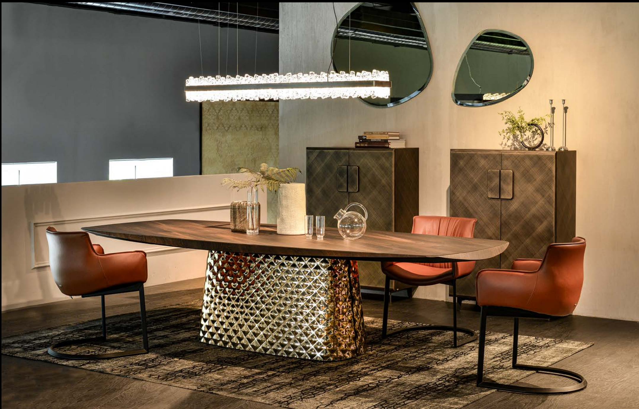
table ATRIUM WOOD: burned oak Masterwood top, bronze base chair RHONDA CANTILEVER: Glove soft leather GLV18 barrique, black frame sideboards TUDOR: Brushed Bronze