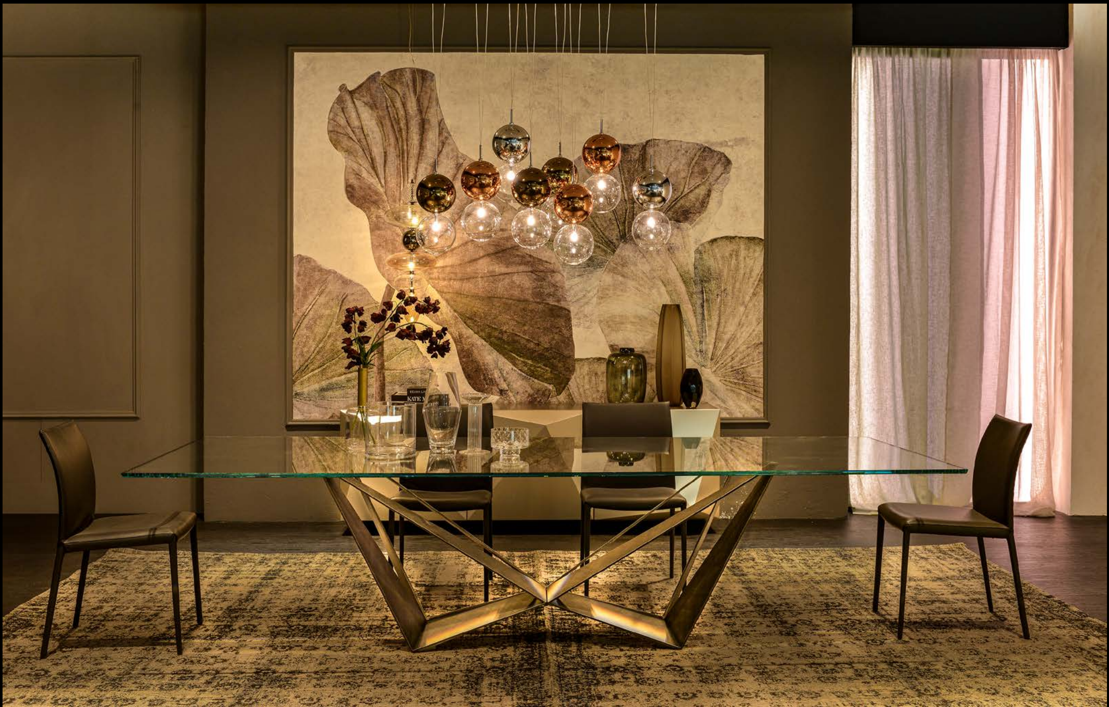
table SKORPIO: extraclear top, Brushed Bronze base chairs NORMA COUTOURE: soft leather 956 atlantico sideboard KAYAK: titanium

rugs MAPOON: 200x300 lamps APOLLO: 8 oval