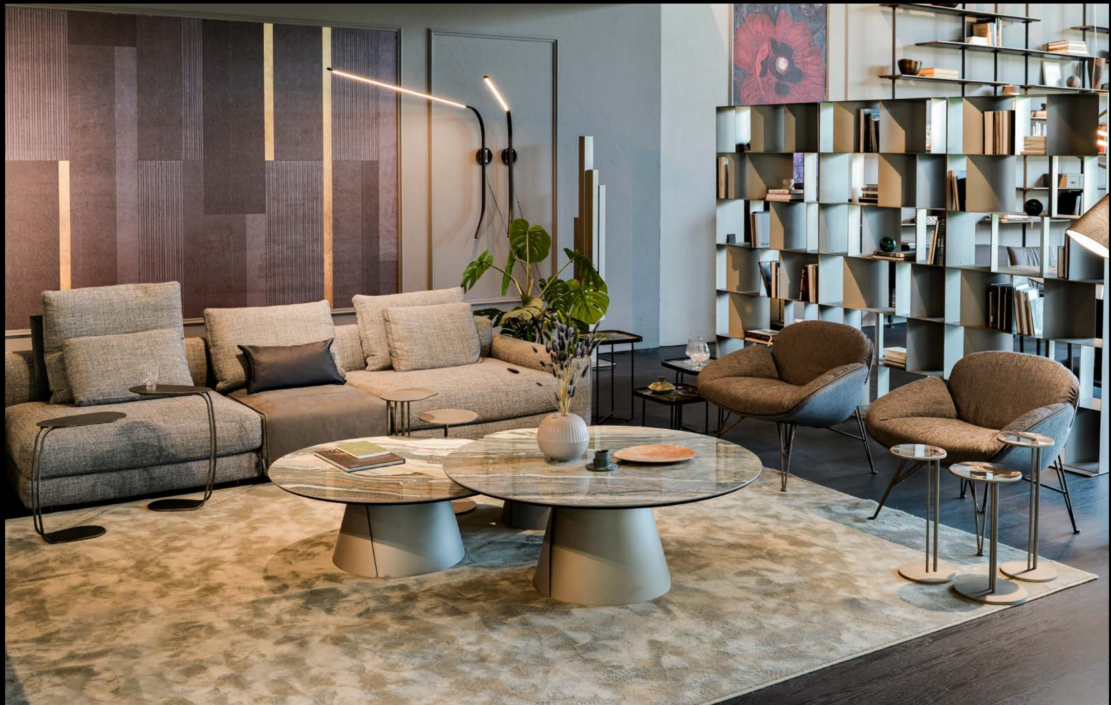
side tables YAGO: Brushed Grey rug KIMI: 300x400 salvia