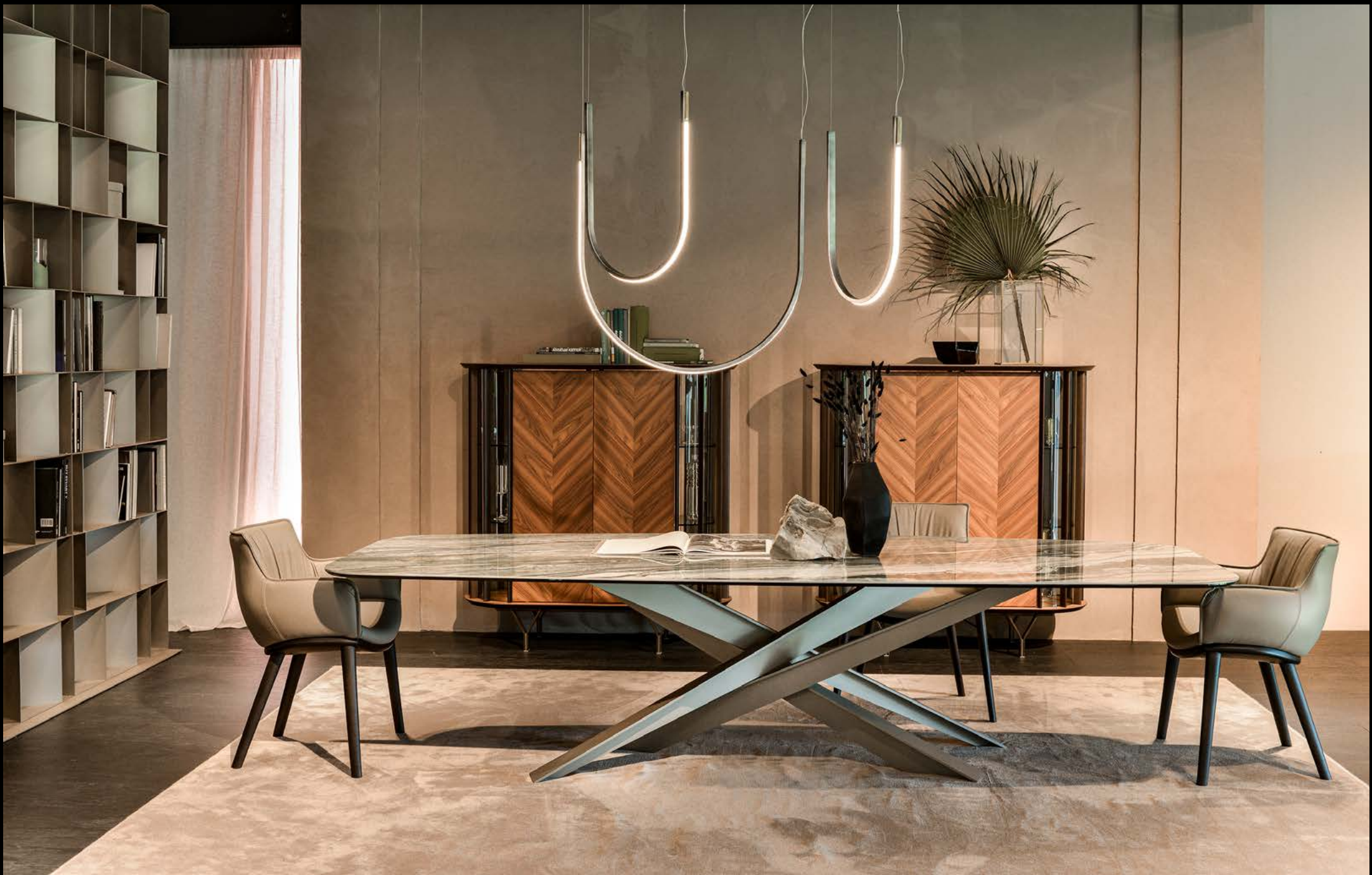
table LANCER KERAMIK: Kaindy ceramic top, titanium base chairs RHONDA WOOD: soft leather 951 castoro, burned oak frame sideboards COSTES: Canaletto walnut