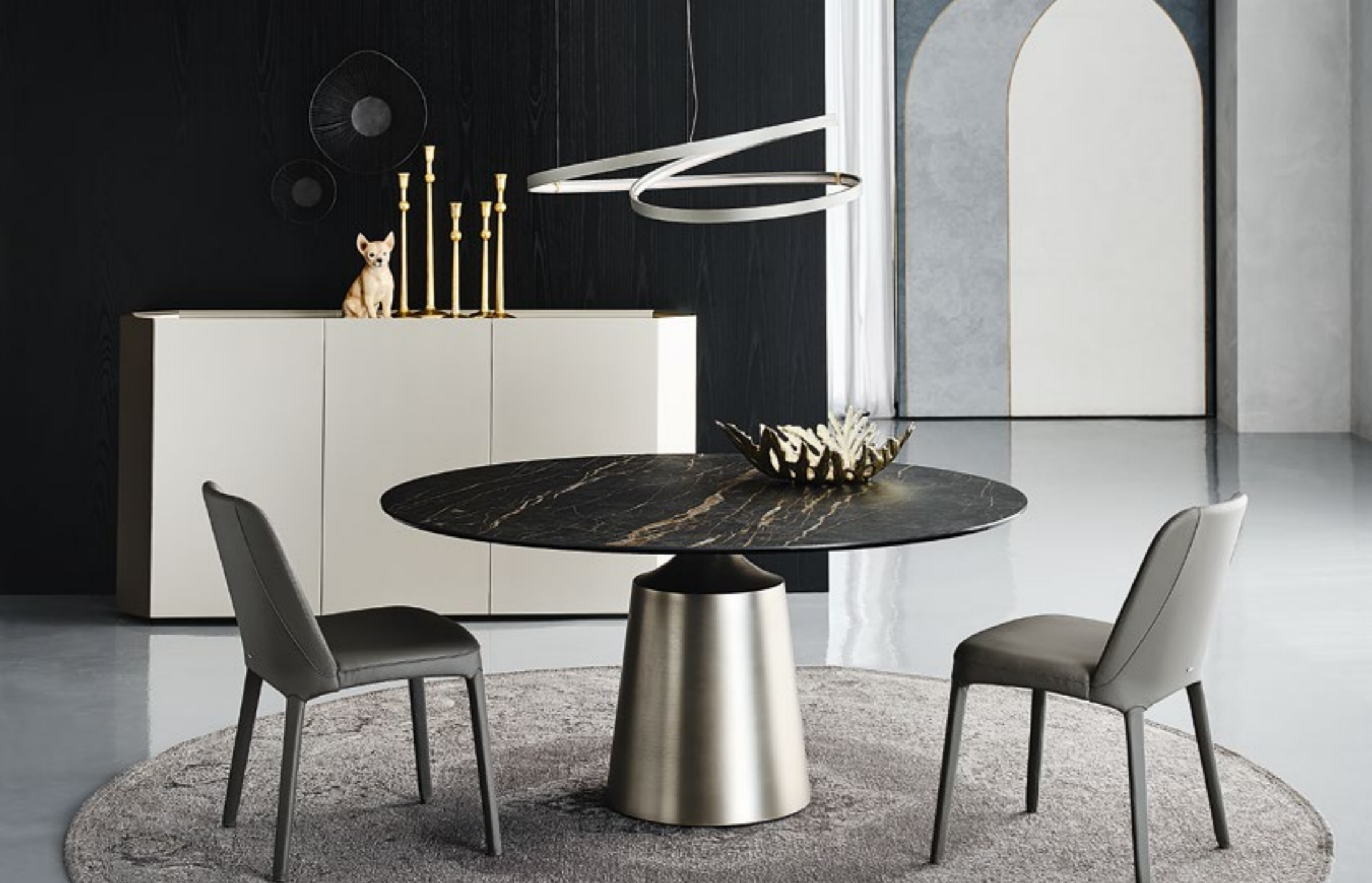
YODA KERAMIK matt portoro chairs WILMA - lamp HEAVEN - sideboard CHELSEA - rug CHENNAI