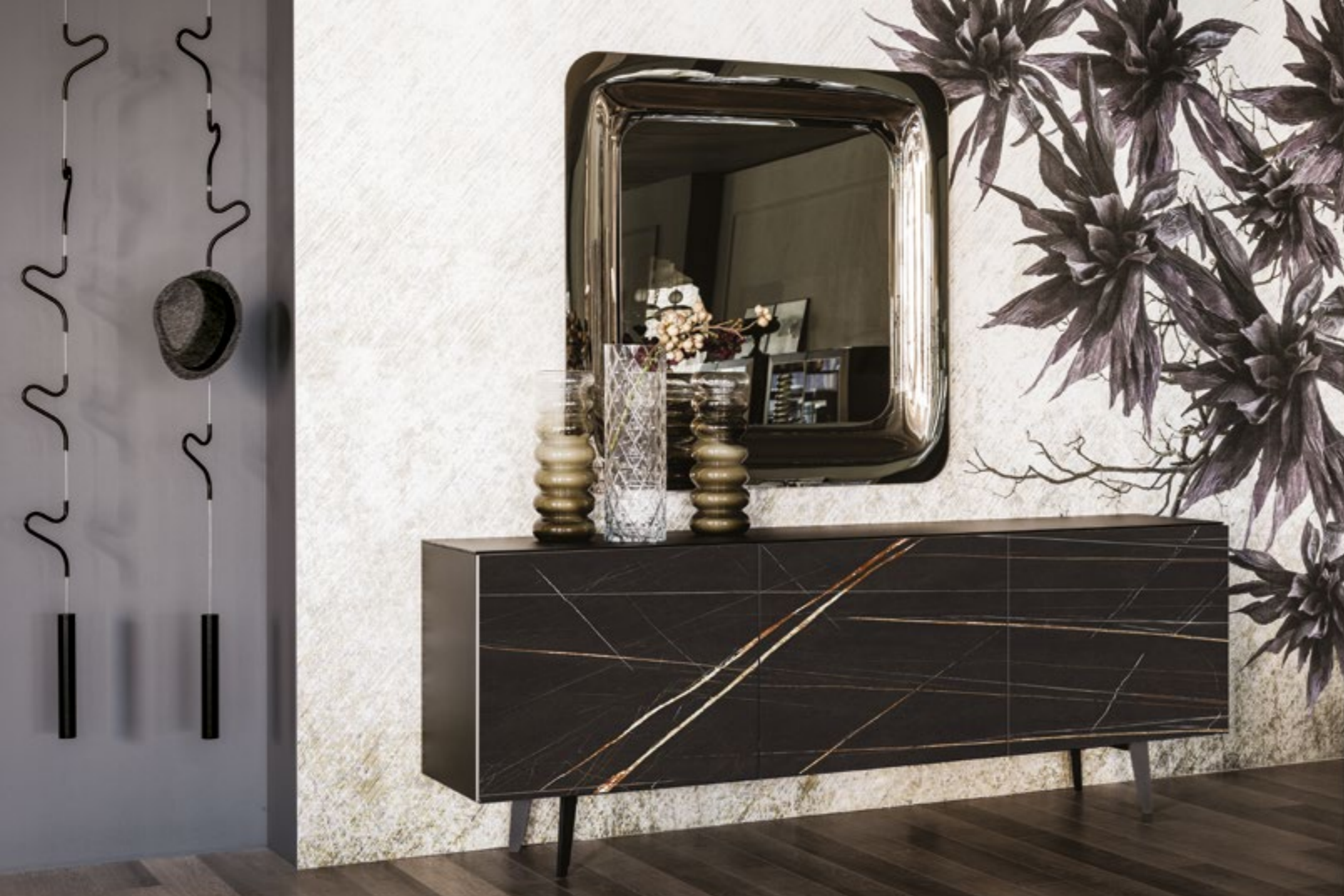
METROPOL sahara noir mirror GLENN - clothes hanger AIR