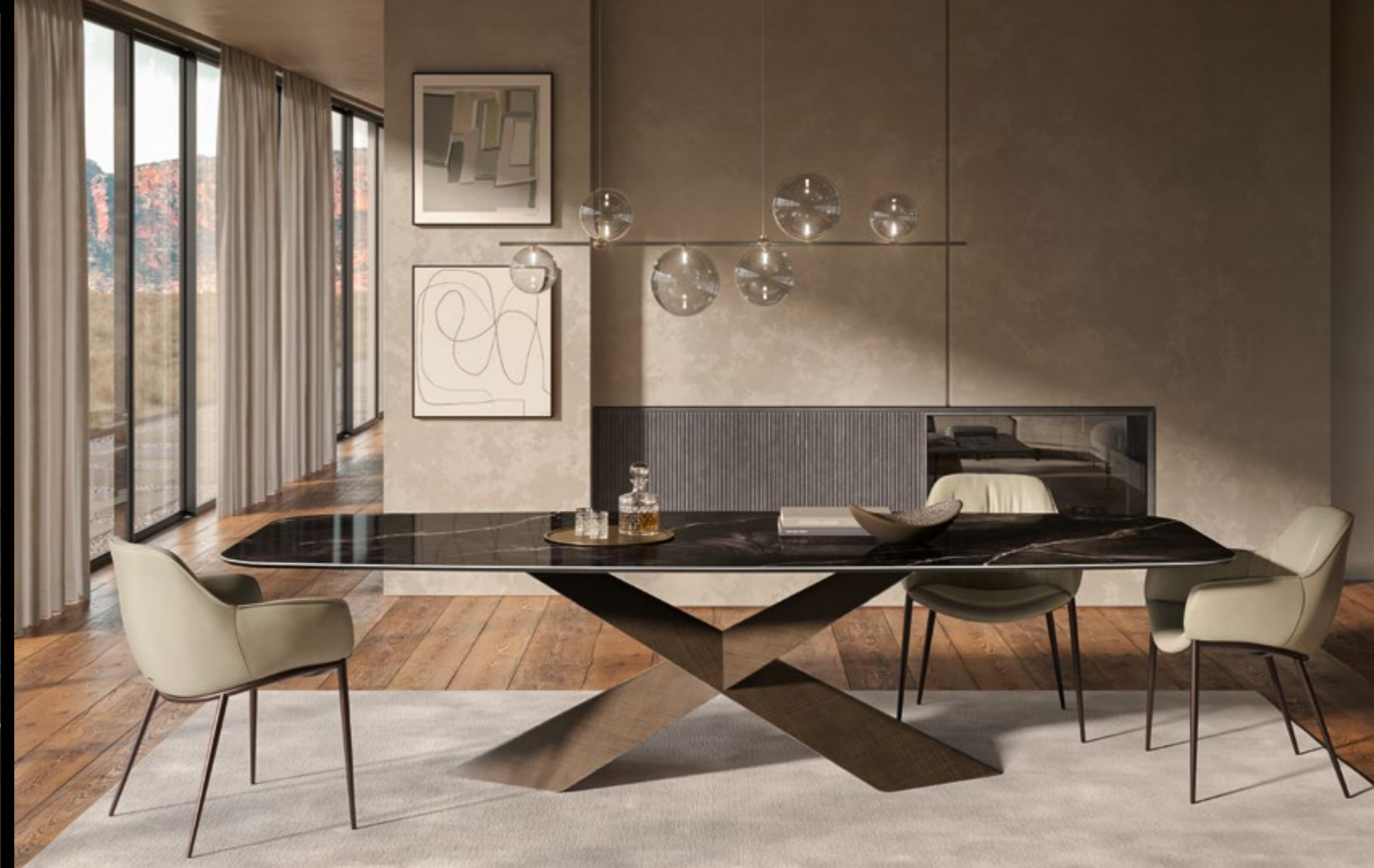
TYRON KERAMIK andromeda chairs SCARLETT ML - lamp BLOOM - rug KIMI

The Andromeda ceramic tables, along with all the accessories in the Keramik collection featuring this finish, have a mysterious and intriguing appearance, perfect for complementing brightly coloured decorative details to create an intense and incisive colour contrast .