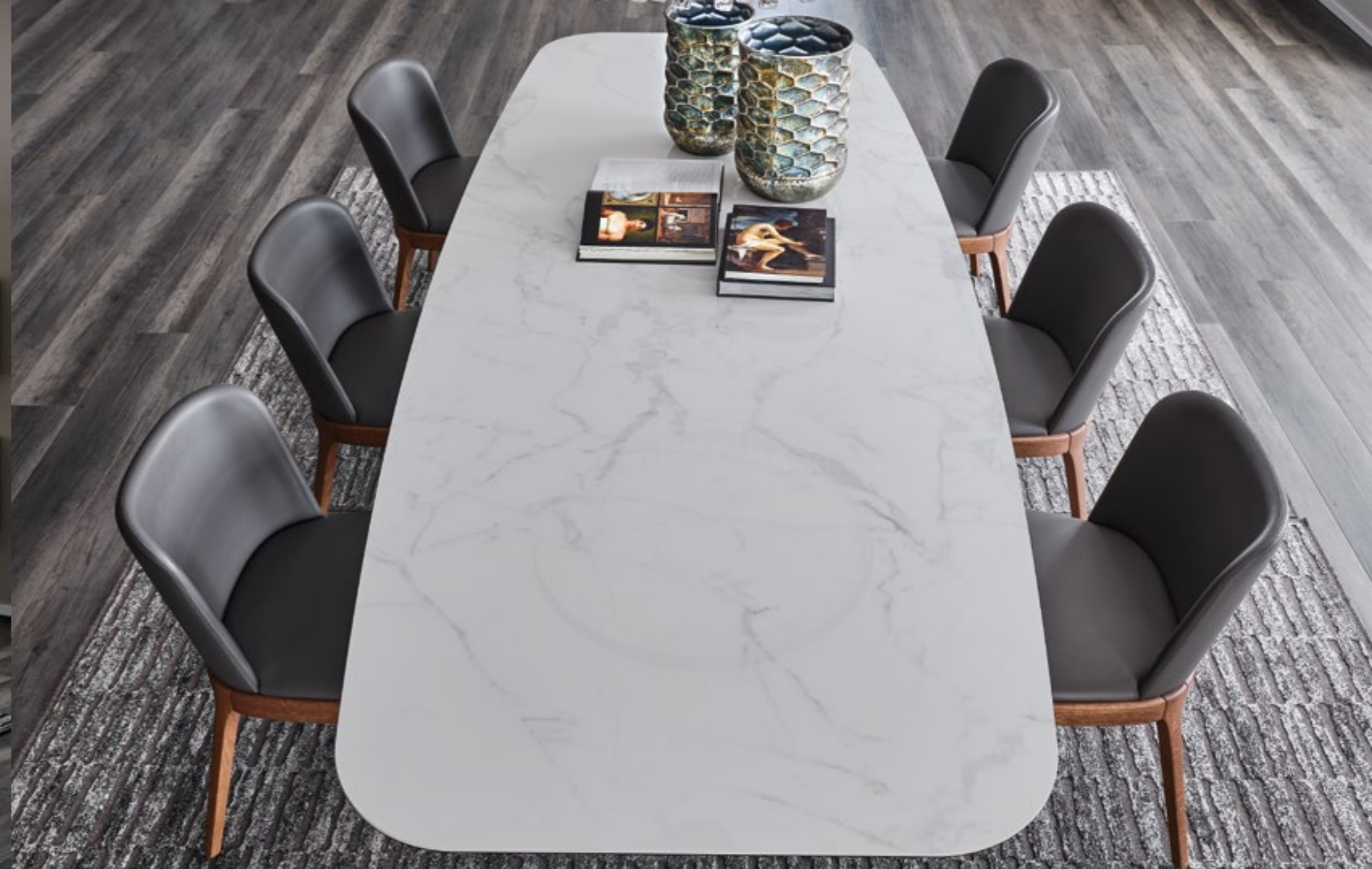
SKORPIO KERAMIK supreme chairs MAGDA - rug MAREK