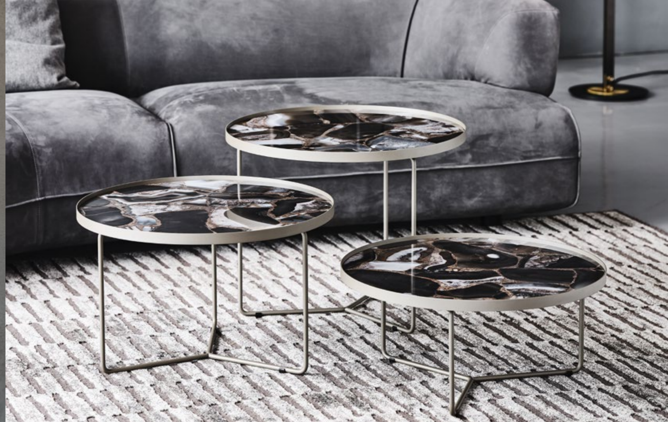
BILLY KERAMIK zefiro rug MAREK