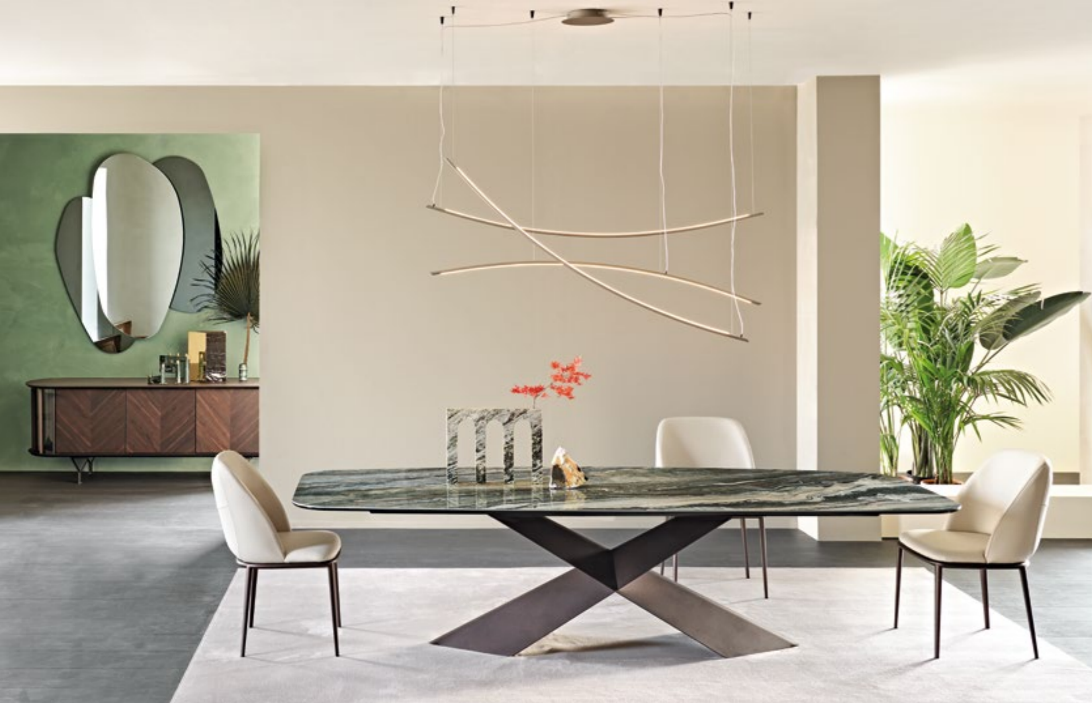
TYRON KERAMIK kaindy chairs MARIEL ML - lamp KATANA - rug KIMI - sideboard COSTES - mirror ULISSE