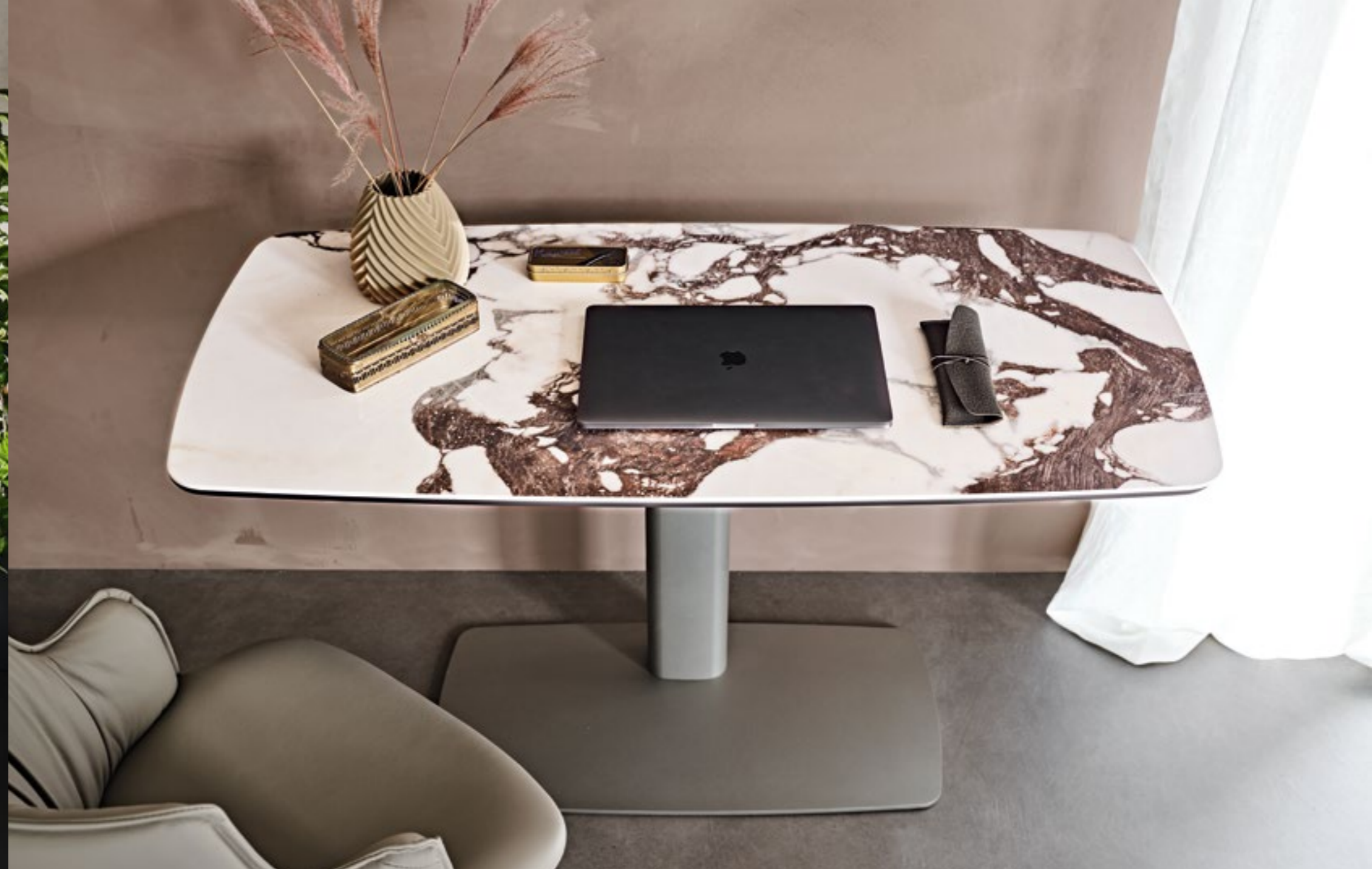
RUNNER KERAMIK breccia chair RIHANNA X