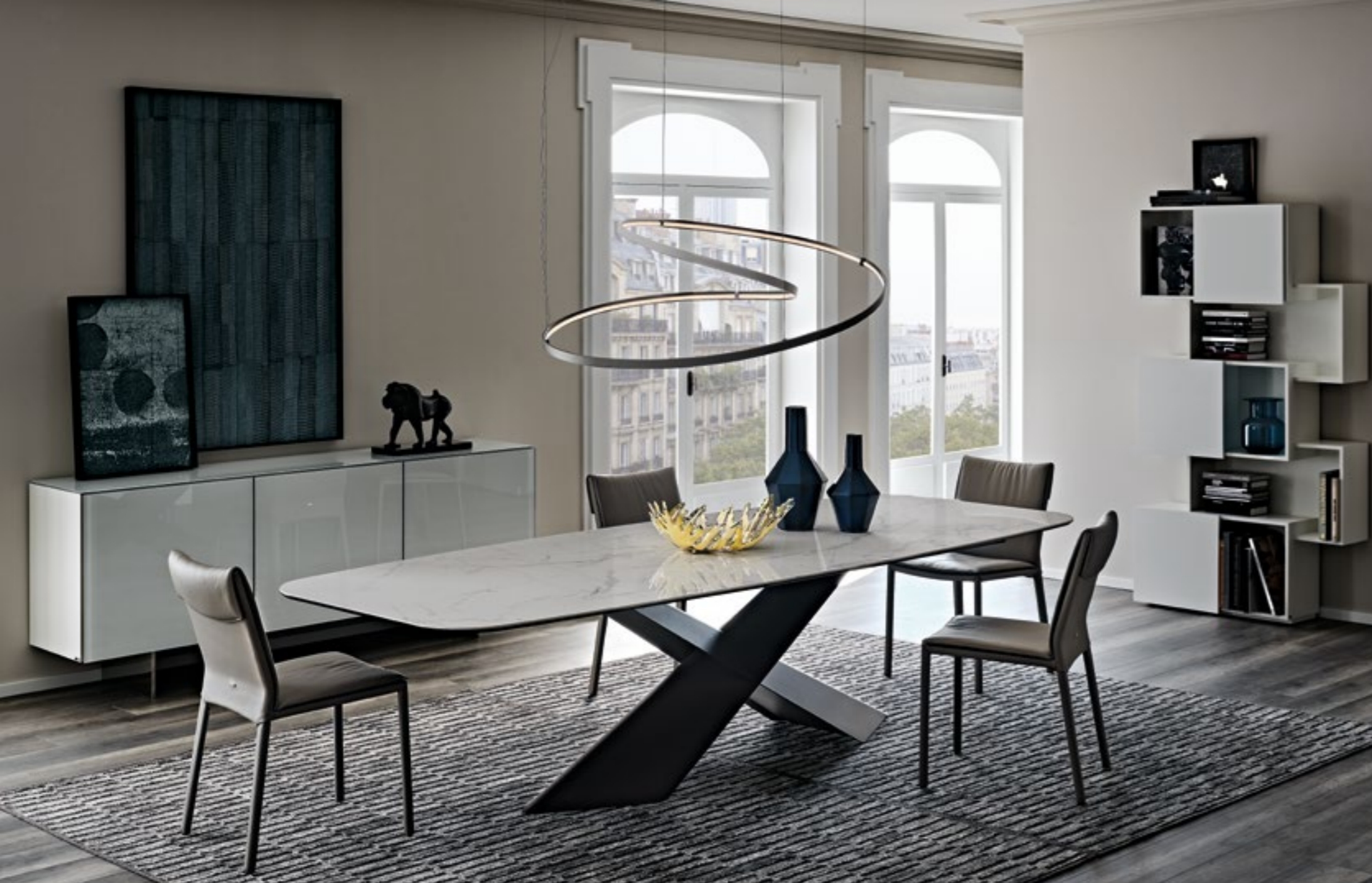
TYRON KERAMIK supreme chairs ISABEL - lamp HEAVEN - sideboard FOCUS - bookcase PIQUANT - rugs MAREK