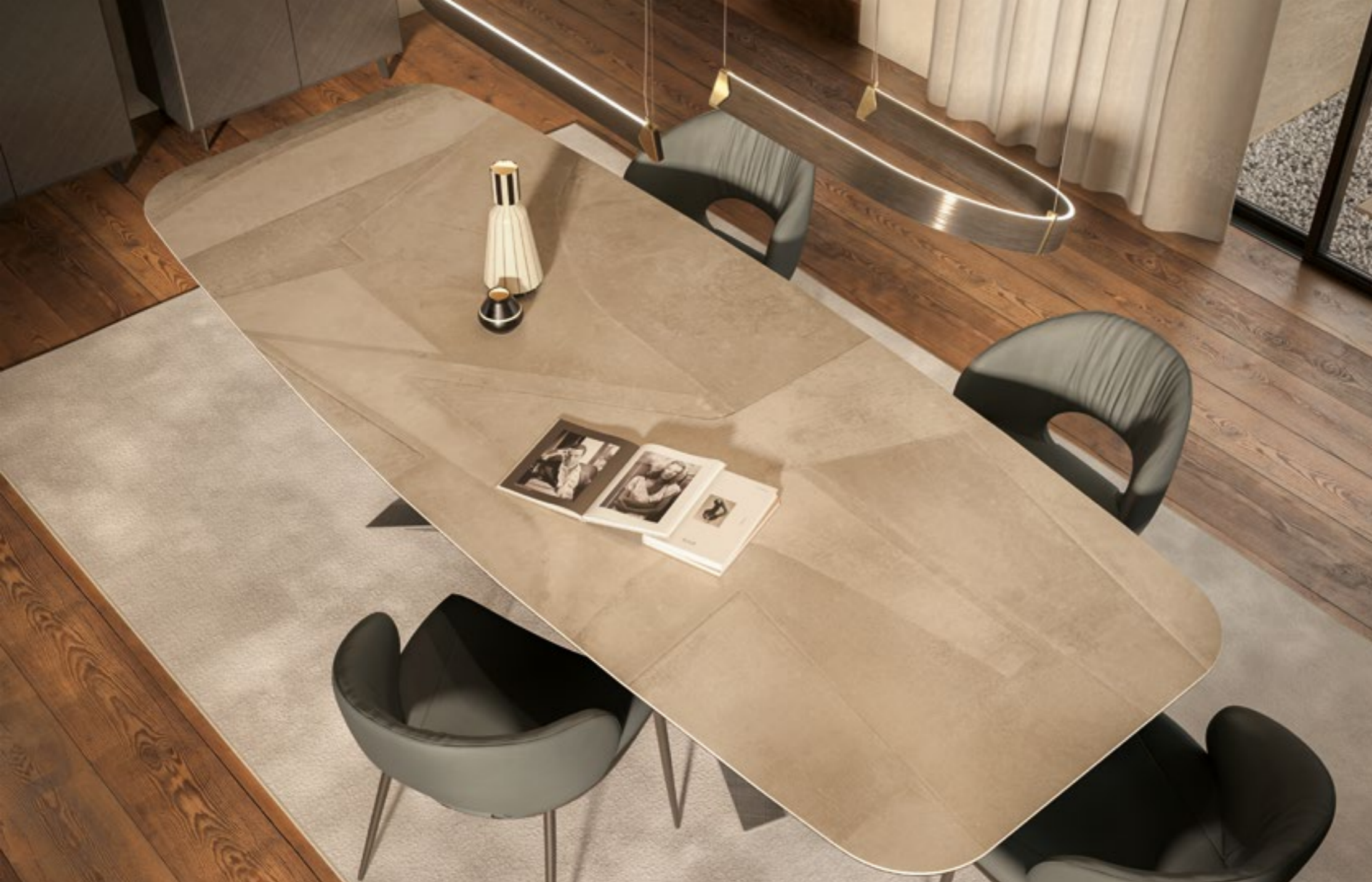
LANCER KERAMIK luxor chairs MIRANDA ML - lamps BLUEBELL - rug KIMI - sideboards TUDOR