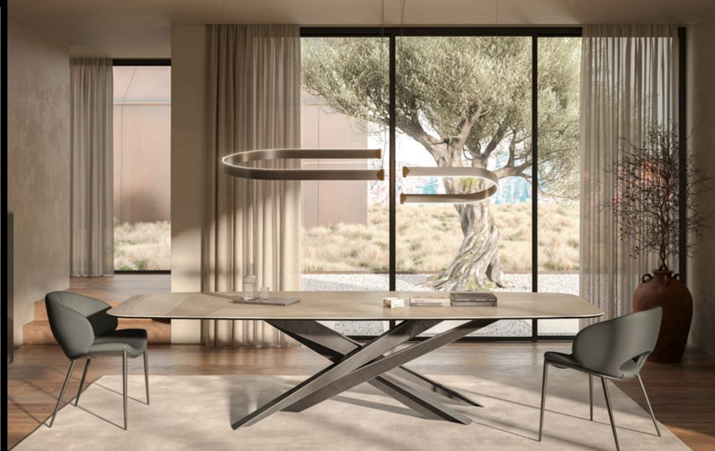
LANCER KERAMIK luxor chairs MIRANDA ML - lamps BLUEBELL - rug KIMI

Different sandblasted hues alternate, changing in intensity in the various parts of the slab, divided by sharp lines that form an irregular, abstract jigsaw puzzle . This finish is delicate and versatile . It goes well with furnishings in warm, dark tones and ultra-modern, distinctive shapes , such as the sculptural bases of ceramic tables and consoles.