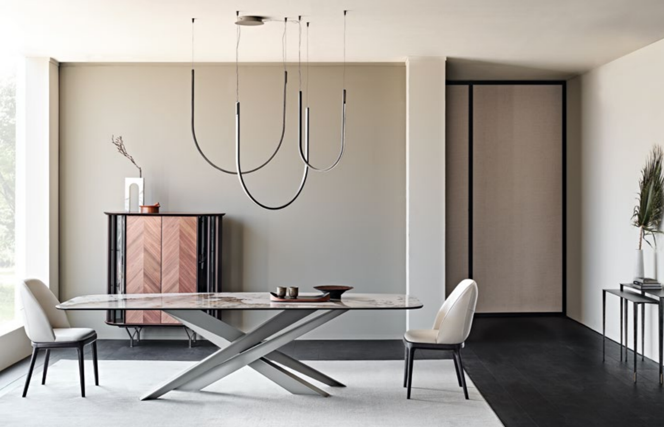
LANCER KERAMIK corcovado chairs MARIEL - lamp Nahun - sideboard COSTES - rug KIMI - console ETOILE