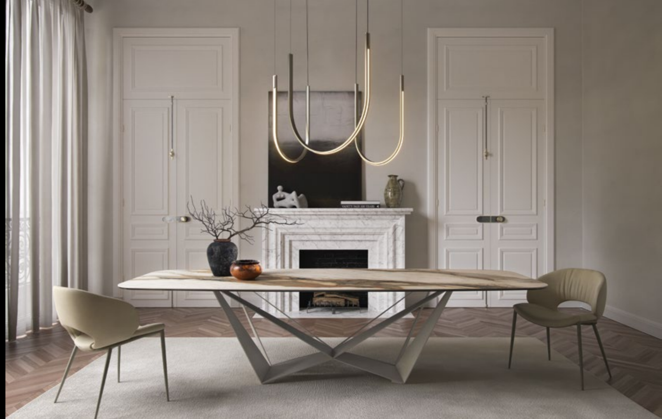
SKORPIO KERAMIK borghini calacatta chairs RHONDA - lamps NAHUN - rug KIMI

This finish is available in the Glossy and Matt versions .