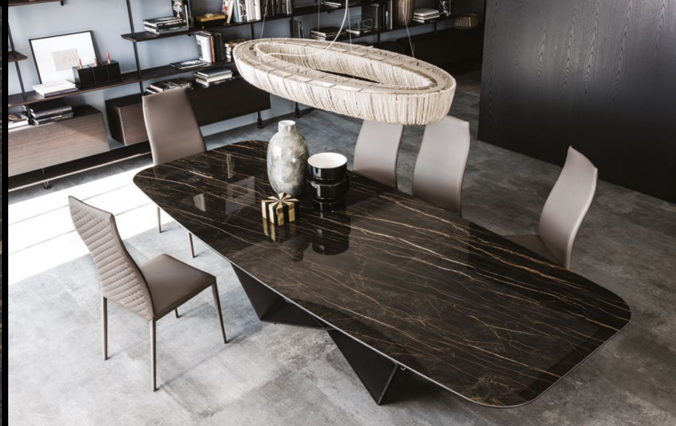
SKORPIO KERAMIK glossy portoro chairs NORMA COUTURE H - lamp CELLINI - bookcase AIRPORT

This ceramic is available in the Glossy and Matt versions .