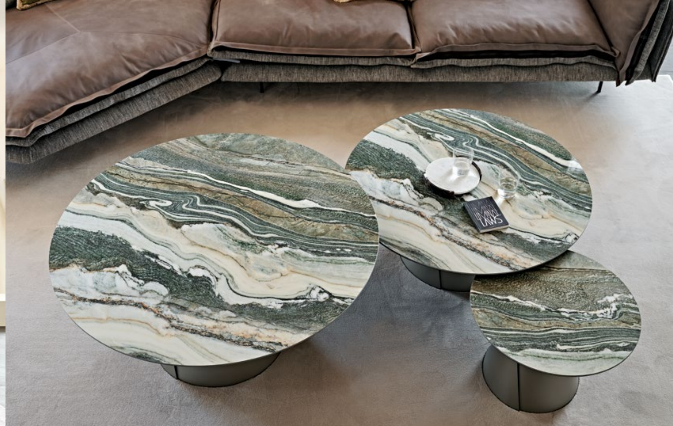
ALBERT KERAMIK kaindy rug KIMI