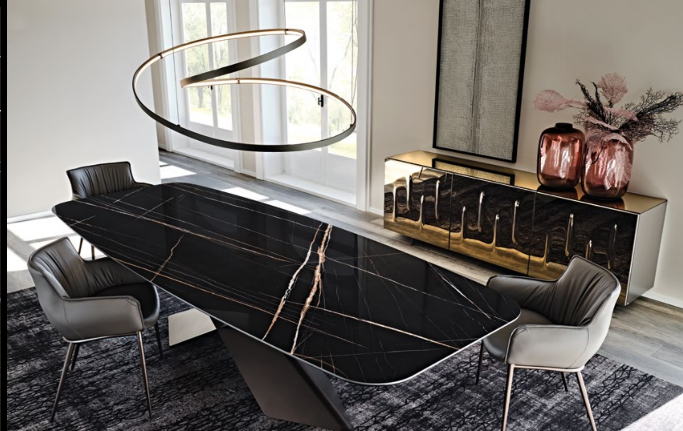
TYRON KERAMIK sahara noir chairs RHONDA - lamp HEAVEN - sideboard CARNABY - rug MUMBAI

Caramel and chalk-coloured etching stands out sharply against a totally black background, intersecting with geometric precision. The ceramic bearing the same name as the precious Sahara Noir marble, originally from Tunisia, is set apart from most natural stone textures by its dark, intense colour and veins that seem to have been meticulously drawn with a ruler by Mother Nature. This finish is undoubtedly our most richly-coloured one and the one with the greatest graphic component . It lends a touch of sensuality and mystery to a room.