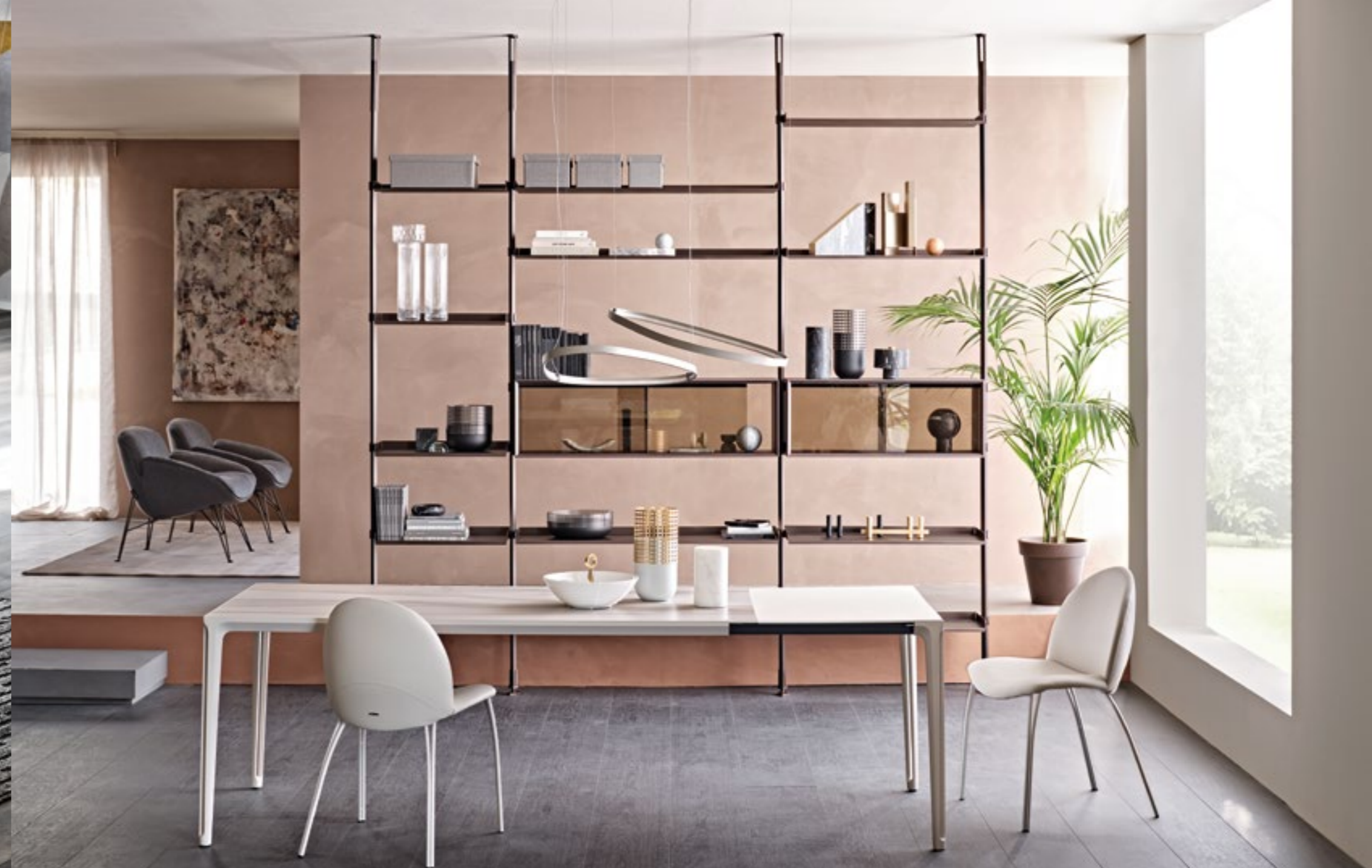
BOULEVARD KERAMIK DRIVE matt golden calacatta chairs KELLY - lamps MAGELLANO - bookcase FREEWAY