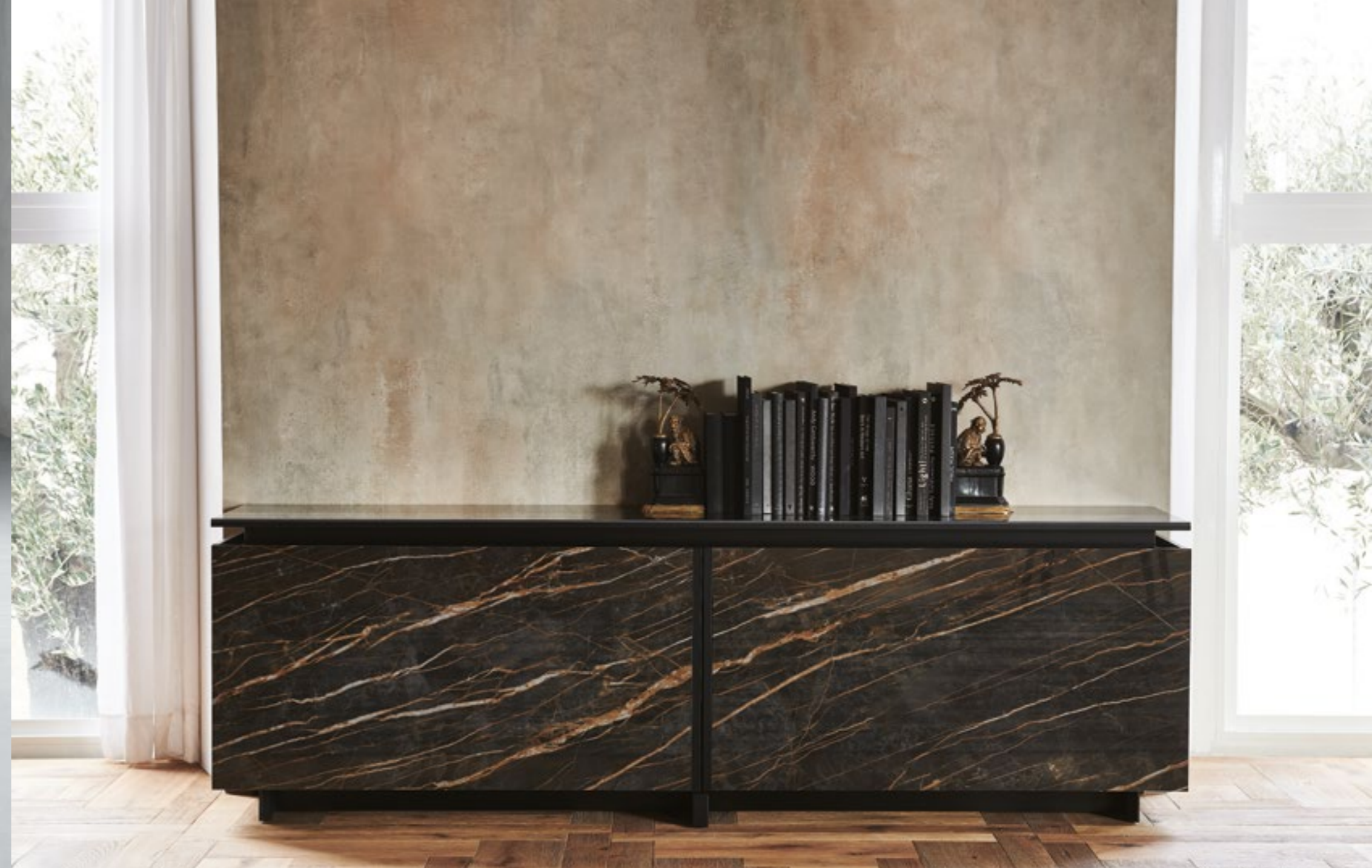
EUROPA KERAMIK glossy portoro shelf TRESOR