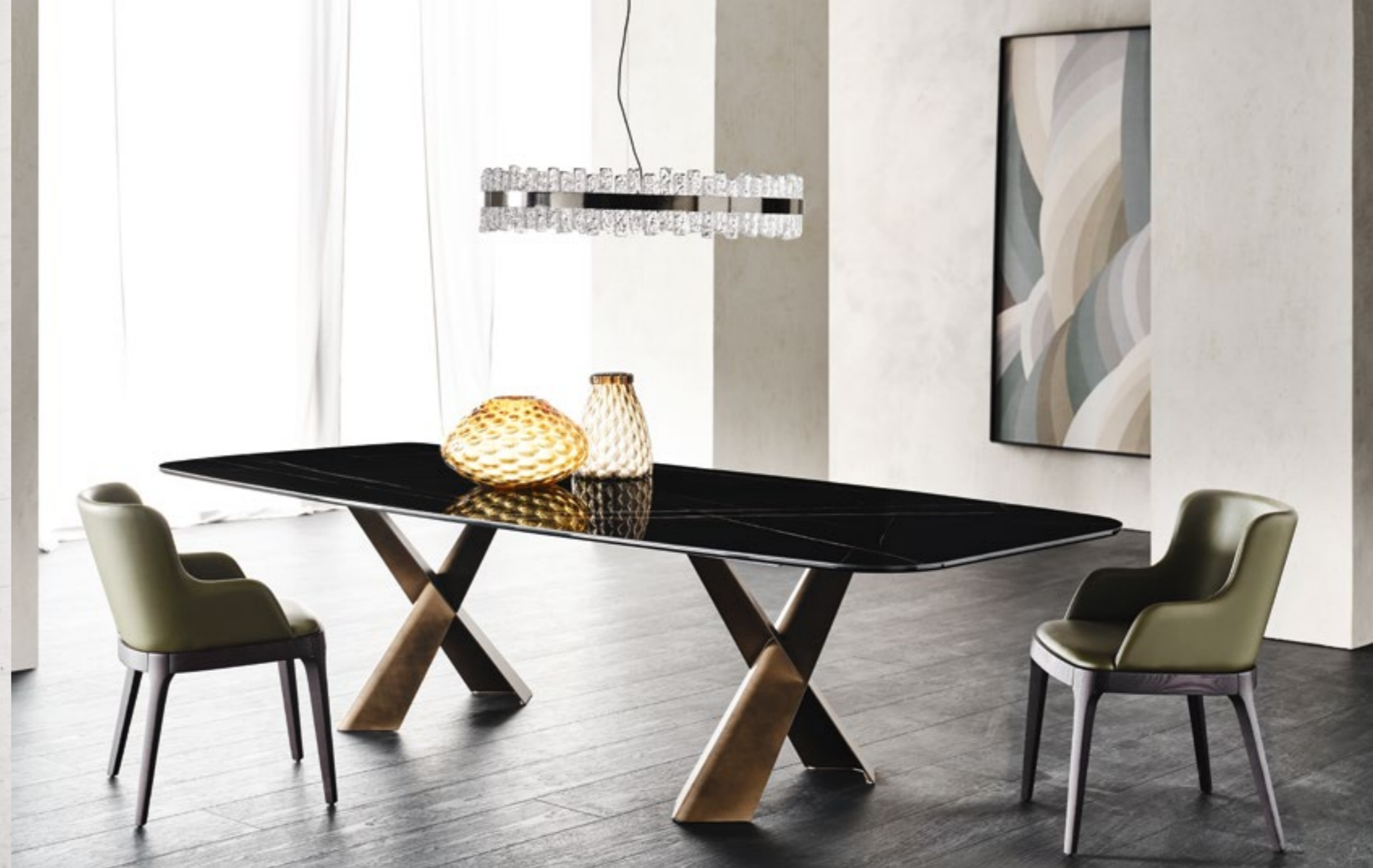
MAD MAX KERAMIK sahara noir chairs MAGDA - lamp PHOENIX