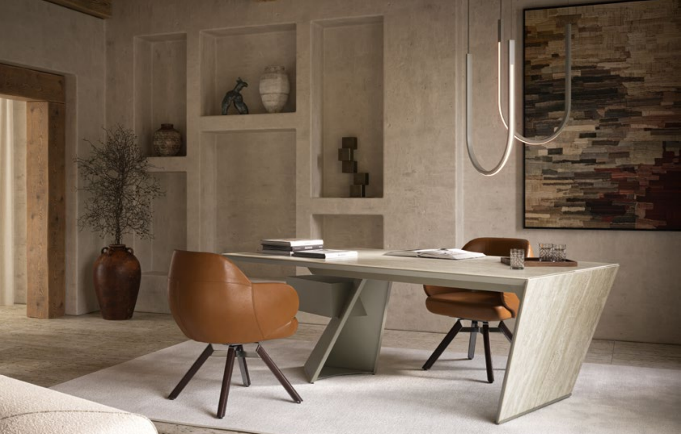
NASDAQ KERAMIK colosseo chairs BOMBÈ - lamps NAHUN - rug KIMI