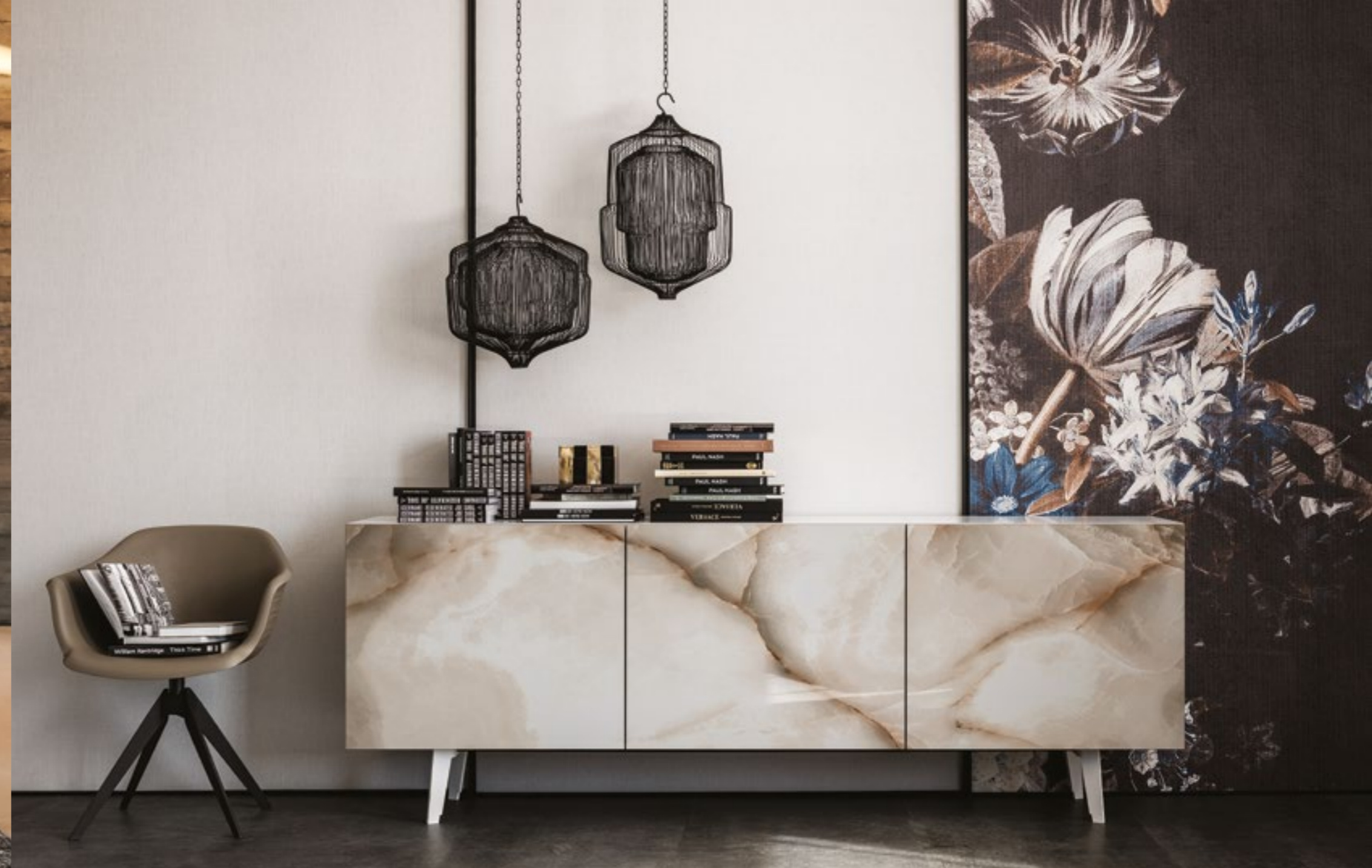
METROPOL alabastro chair INDY