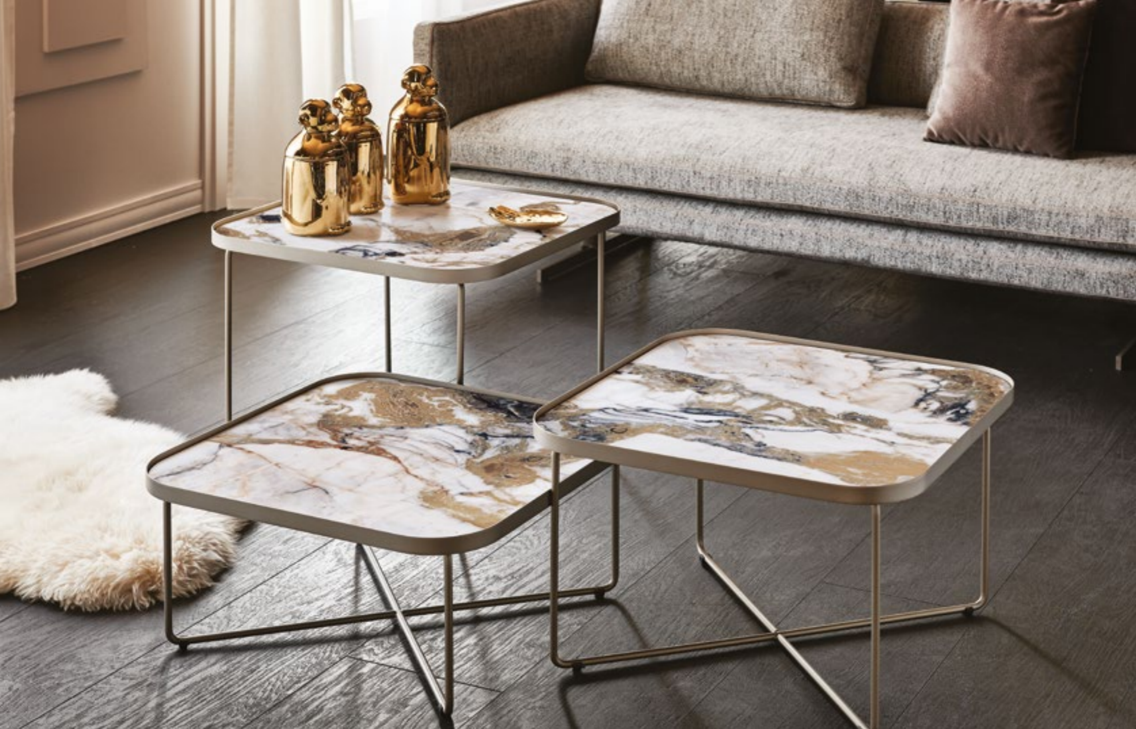
BENNY KERAMIK makalu