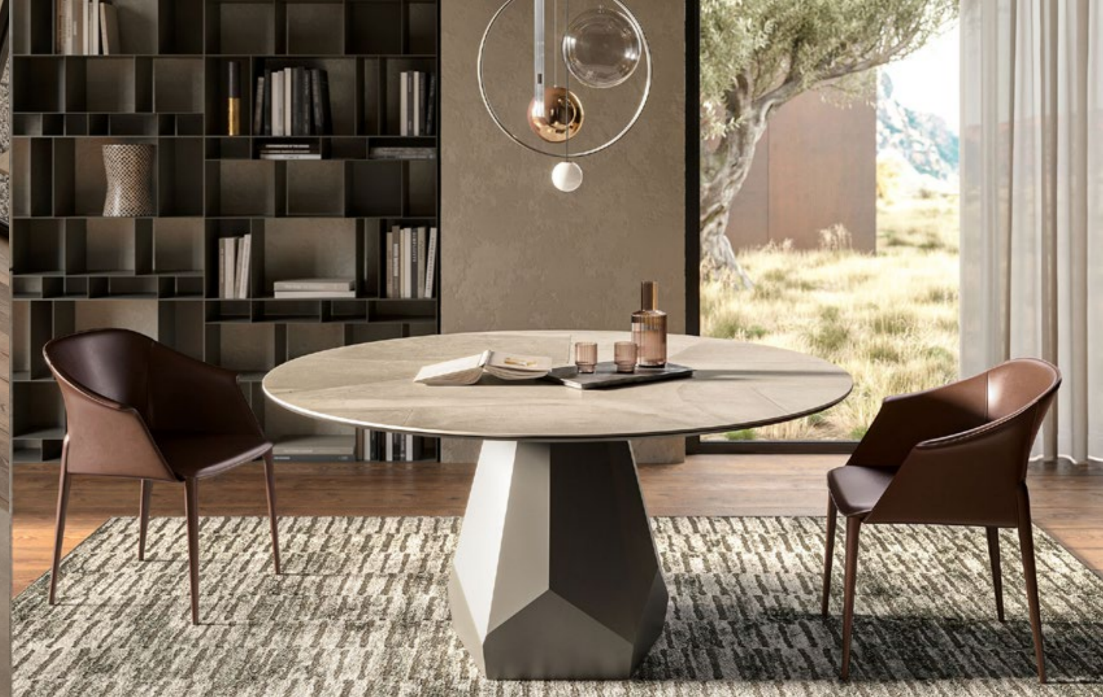
ZERMATT KERAMIK luxor chairs ZULEIKA - lamp BIARRITZ - rug MAREK - bookcase LATITUDE