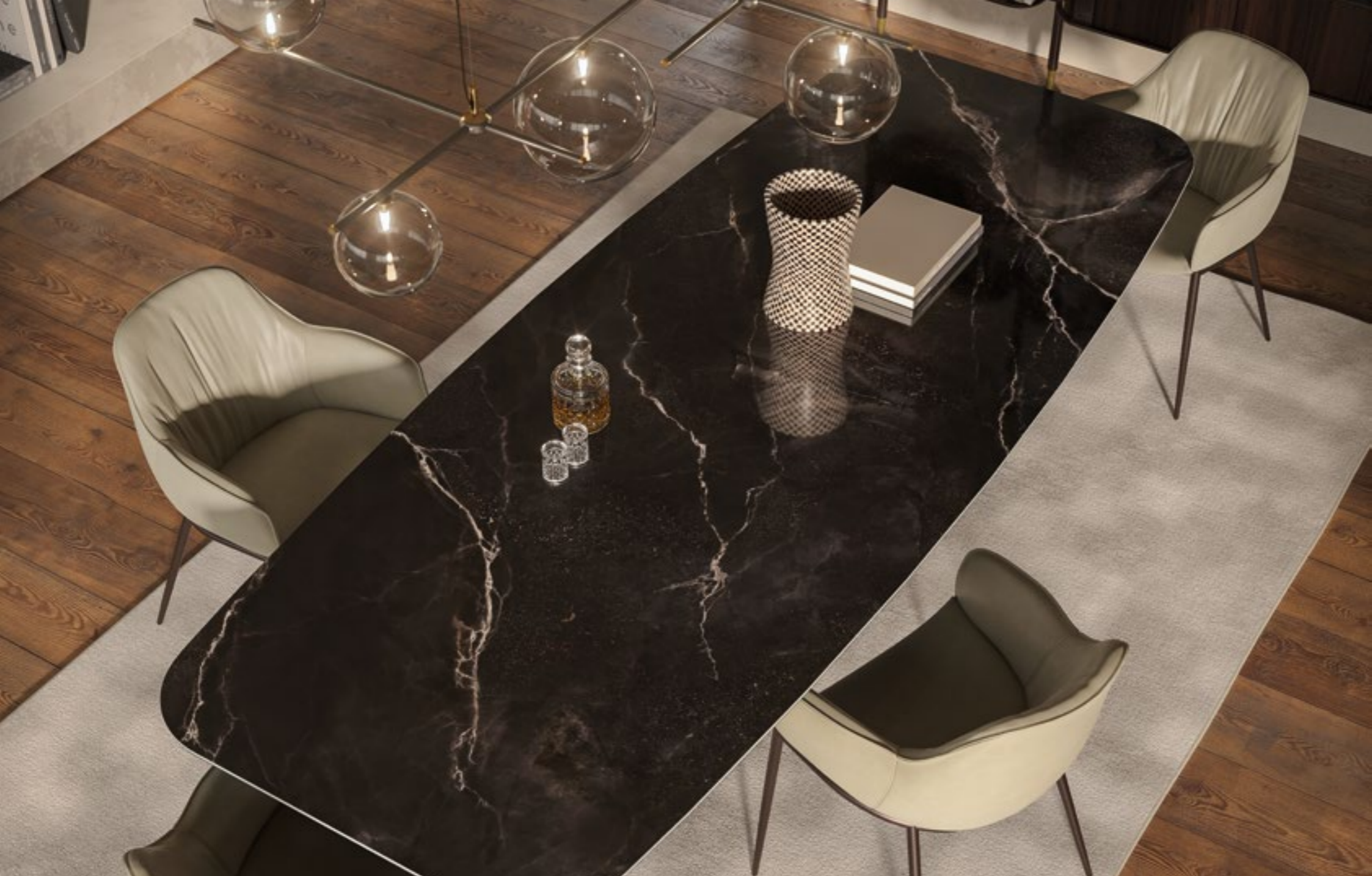
TYRON KERAMIK andromeda chairs SCARLETT ML - lamp BLOOM