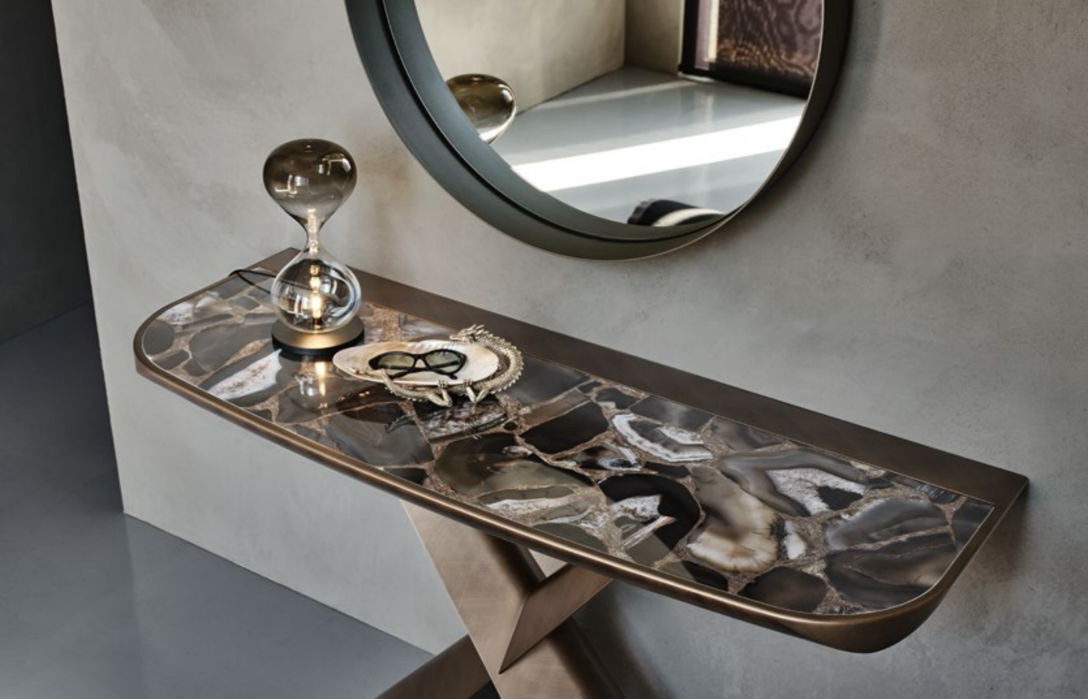
TERMINAL KERAMIK PREMIUM zefiro mirror WISH