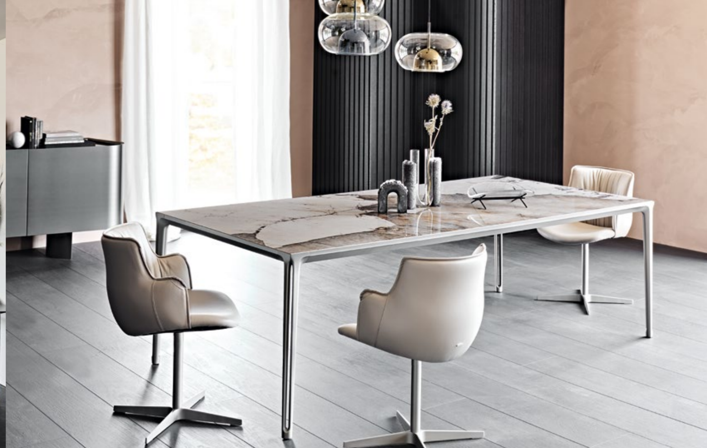
BOULEVARD KERAMIK corcovado chairs RIHANNA X