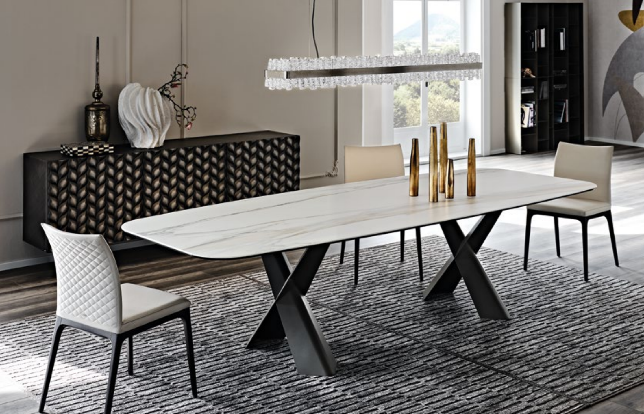
MAD MAX KERAMIK matt golden calacatta chairs ARCADIA COUTURE - lamp PHOENIX - rugs MAREK - sideboard LAVANDER