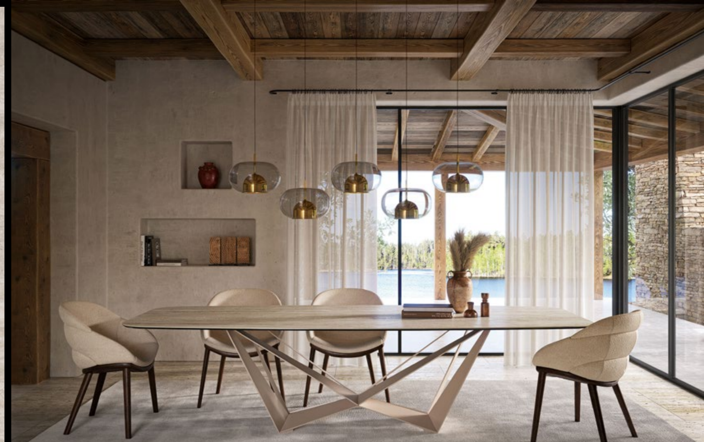
SKORPIO KERAMIK colosseo chairs CAMILLA - lamps COIMBRA - rug KIMI

This ceramic expresses all its charm when combined with natural woods and metallic finishes in soft colours.