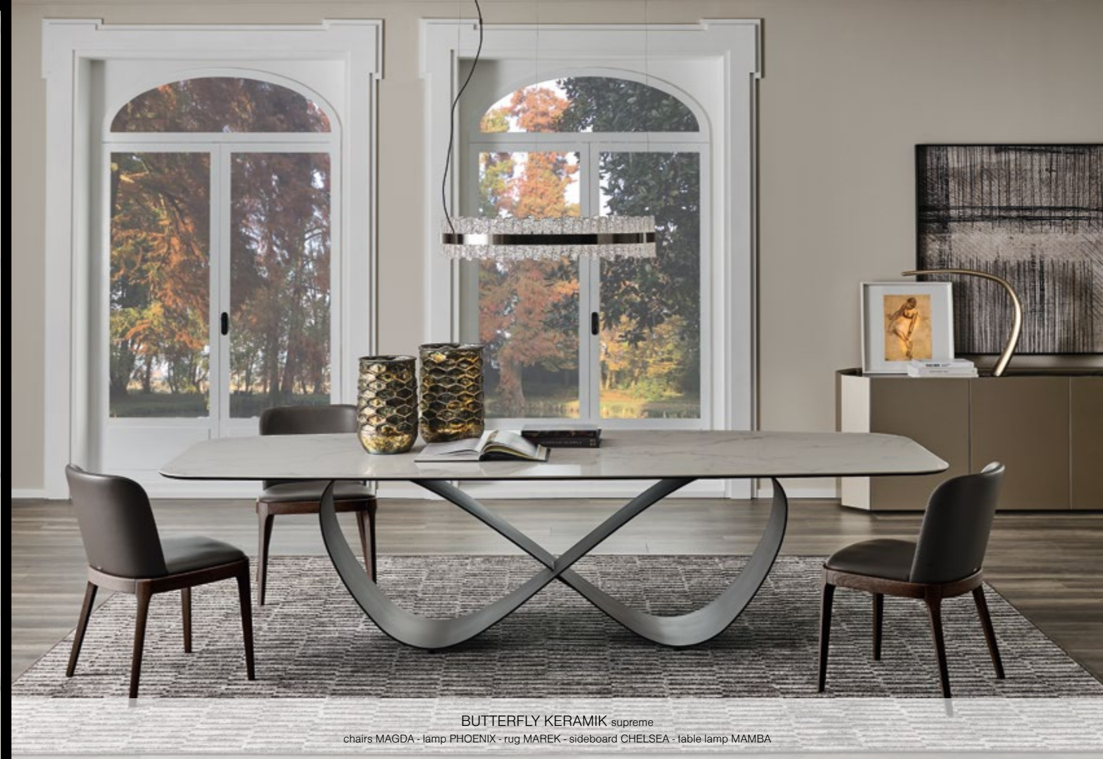
BUTTERFLY KERAMIK supreme chairs MAGDA - lamp PHOENIX - rug MAREK - sideboard CHELSEA - table lamp MAMBA

Supreme is the lightest and brightest finish in the Keramik collection, designed for elegant ceramic tables and consoles, delicate modern sideboards and coffee tables and ceramic desks for furnishing executive offices. The bright white base and silvery veins make for a very luminous environment and allow you to be daring with vivid colours, preferably in cool tones. Moreover, this Statuario marble-effect ceramic is ideal when combined with metallic materials, such as the Brushed Grey finish.