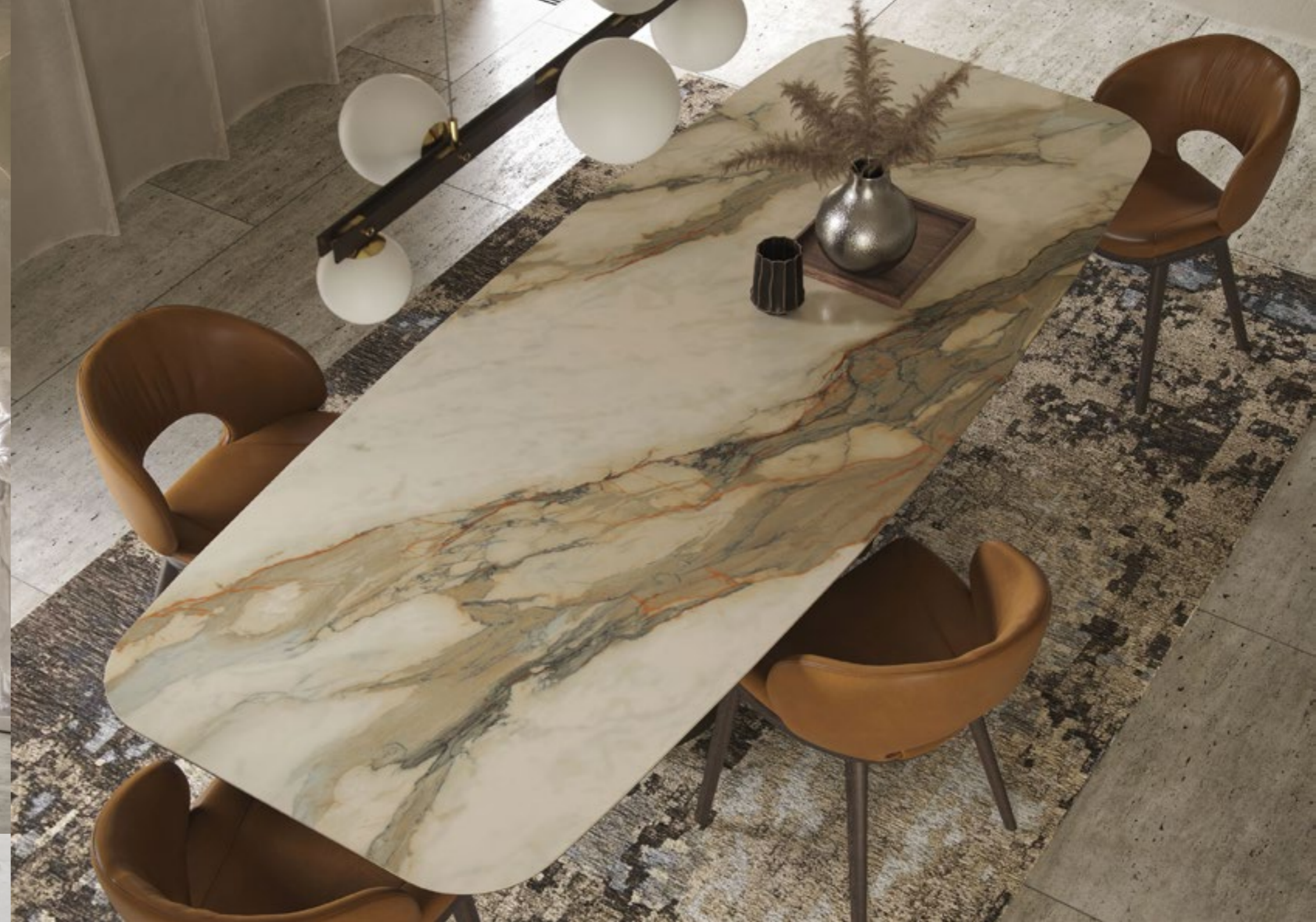
SCOTT KERAMIK borghini calacatta chairs MIRANDA WOOD - lamp PLANETA - rug RADJA