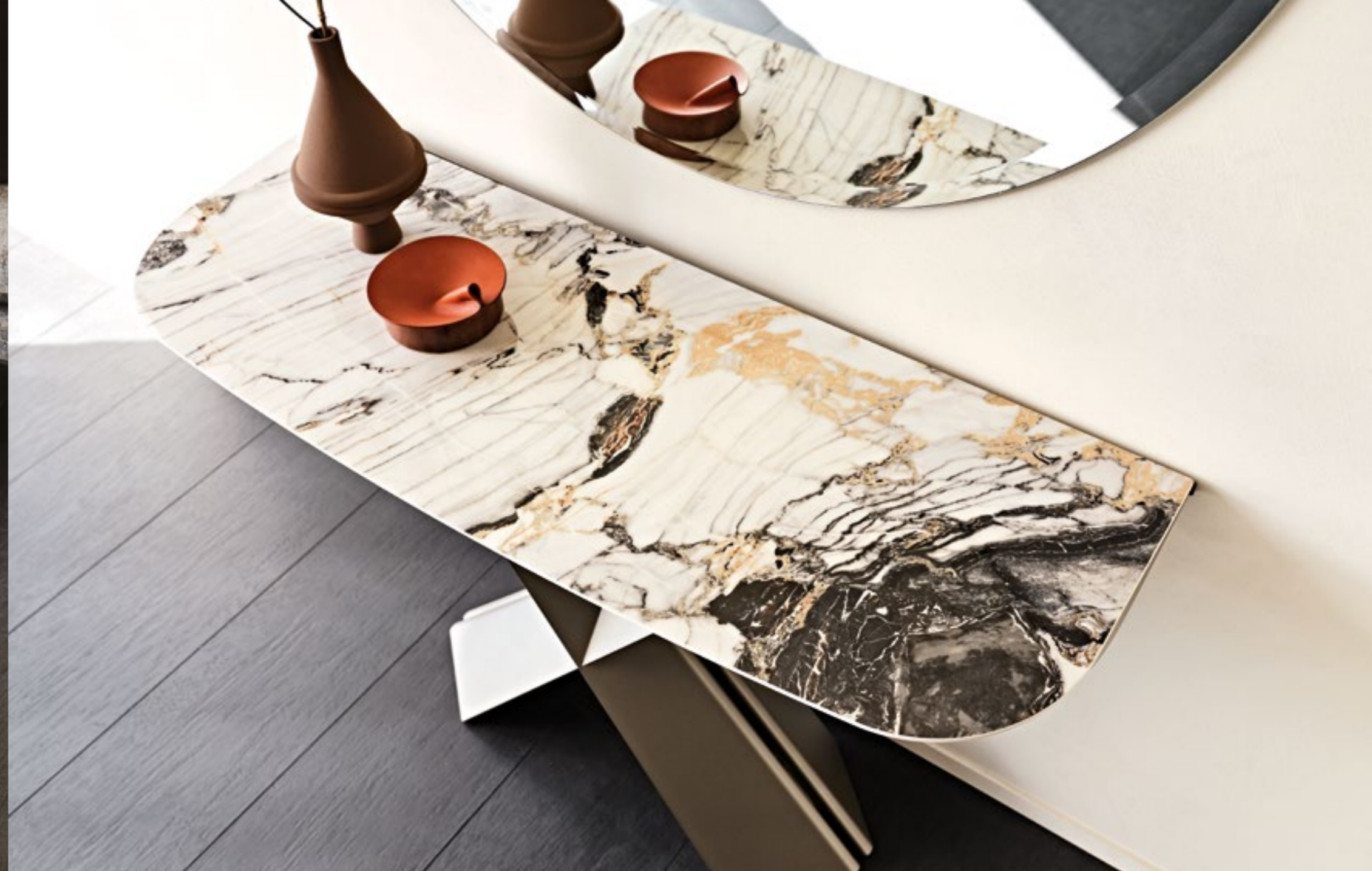
TERMINAL KERAMIK DRIVE makalu mirror HAWAII ROUND