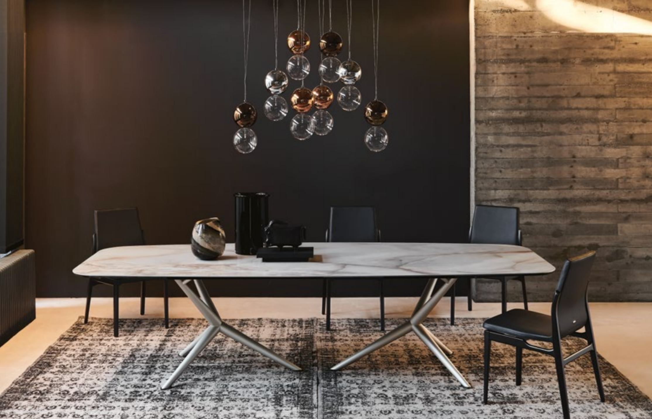
ATLANTIS KERAMIK alabastro chairs GINEVRA - lamp APOLLO - rugs MAPOON