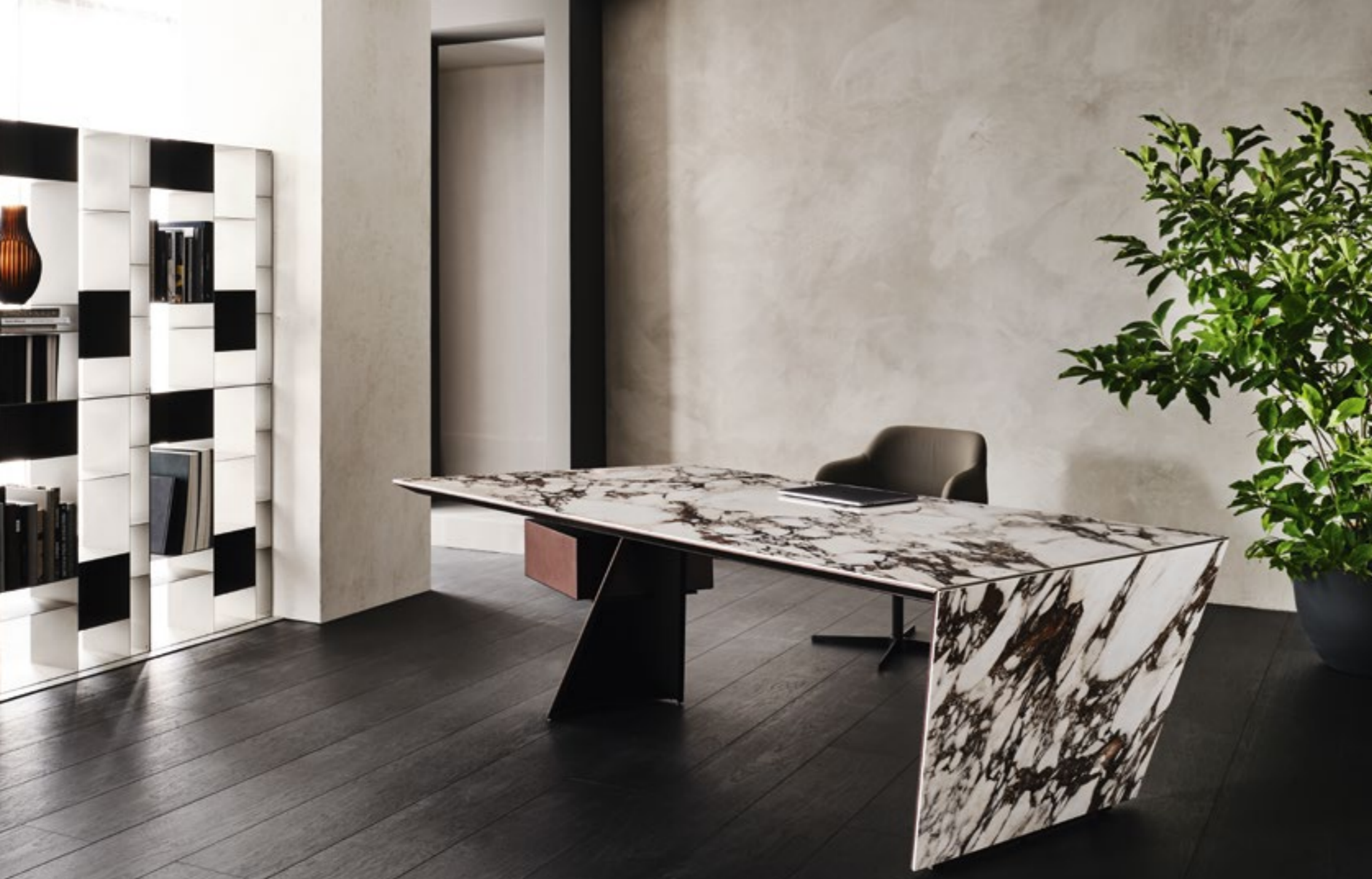
NASDAQ KERAMIK breccia chair BOMBÈ X - bookcases LATITUDE